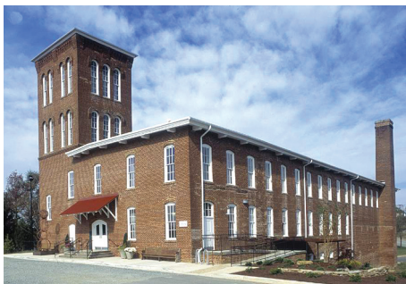
Prizery/R.J. Reynolds Tobacco Warehouse, South Boston, Virginia (1900). Rehabilitated for commercial use.

The NPS or the SHPO may inspect a rehabilitated property at any time during the five-year period. The NPS may revoke certification if work was not done as described in the Historic Preservation Certification Application, or if unapproved alterations were made for up to five years after certification of the rehabilitation. The NPS will notify the IRS of such revocations.