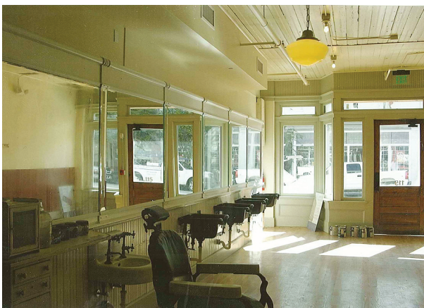
Odd Fellows Building, Raleigh, North Carolina (c. 1880). Rehabilitated for continued commercial use.