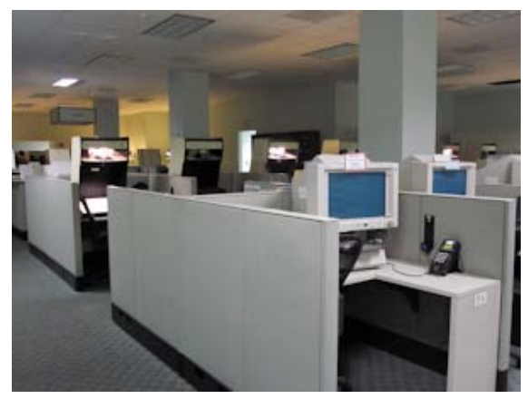
Current Microfilm Reading Room