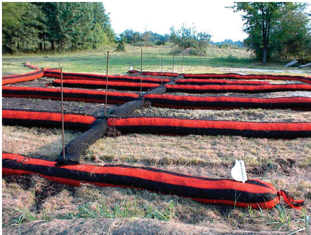
Figure 6 Vegetated compost filter socks