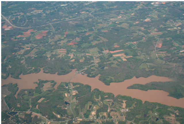
Figure 1 Sediment contributing to high turbidity in Tom-A-Lex Lake after storm event

A major function of soil organic matter is filtration of pollutants introduced through natural infiltration and subsurface hydrologic flow patterns, prior to ground and surface water recharge.