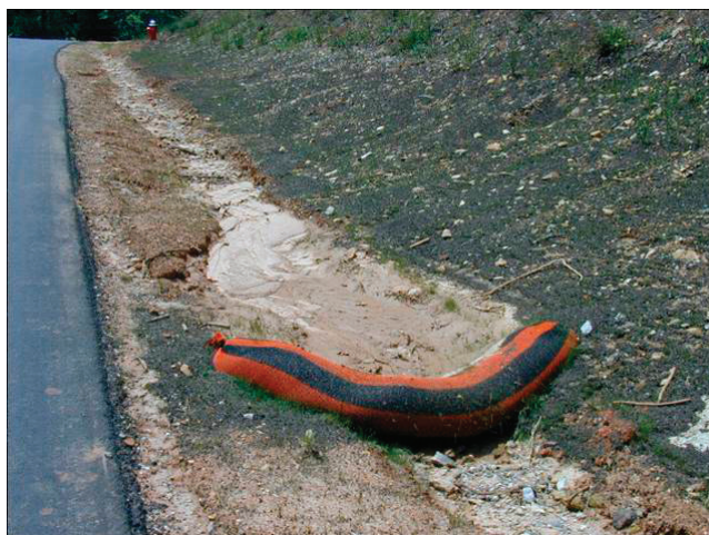
Figure 4 Compost filter sock curb inlet