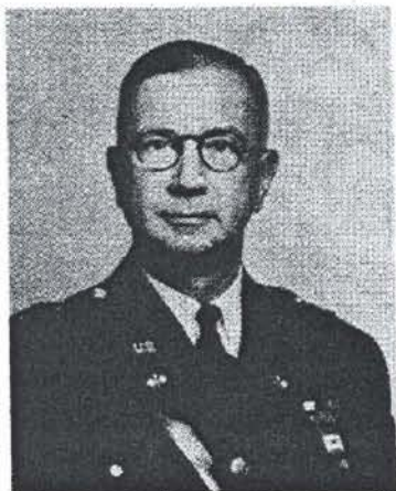
Major General Joseph Mauborgne

During 1938-39, U.S. successes against both the naval and diplomatic targets began to unravel as the Japanese changed their long-standing cryptographic systems. These developments brought the two U.S. military departments back to the bargaining table in mid-1940. As usual, both sides agreed to go their own way on international commercial and counterpart communications. Regarding diplomatic communications, General Joseph O. Mauborgne, Chief Signal Officer, U.S. Army, proposed an elaborate study to determine which targets could be heard by the individual stations of each service. According to Mauborgne's proposal, responsibility would be assigned according to hearability, frequency, time of day, type of transmission, and, in the case of duplication, preponderance of copy without regard for the underlying value of any intelligence to the intercepting agency.