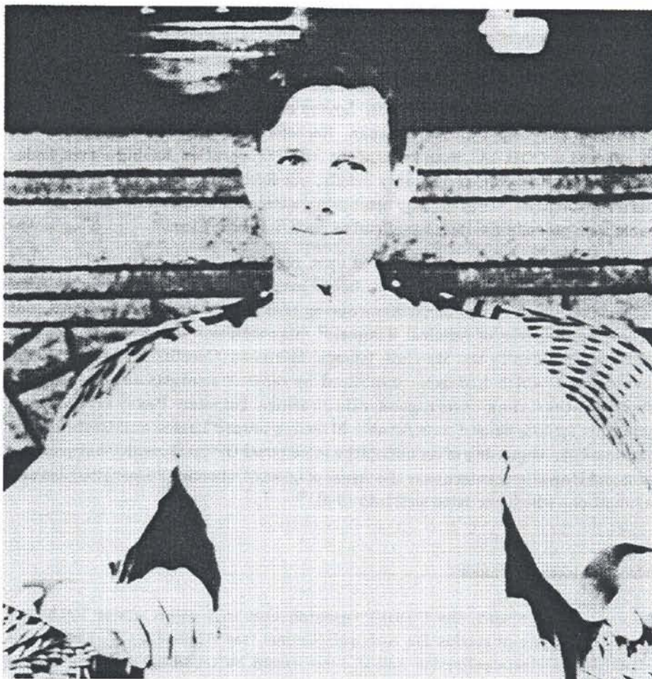
Lieutenant Joseph Rochefort, OIC Station Hypo

In many respects COM-14's efforts and achievements in 1941 were similar to what had been accomplished at Station C with traffic analysis against the Japanese Imperial Fleet maneuvers in the 1930s. The COM-14 daily summaries clearly showed that Lieutenant Thomas A. Huckins and Lieutenant John A. Williams, who headed the traffic analysis unit, had solved both the strategic and tactical Japanese naval communications structures. They understood the callsign generation system and were able quickly to re-establish order of battle data after routine callsign changes. This insight permitted unit identifications to the squadron level in ground-based-air and destroyer units. It also