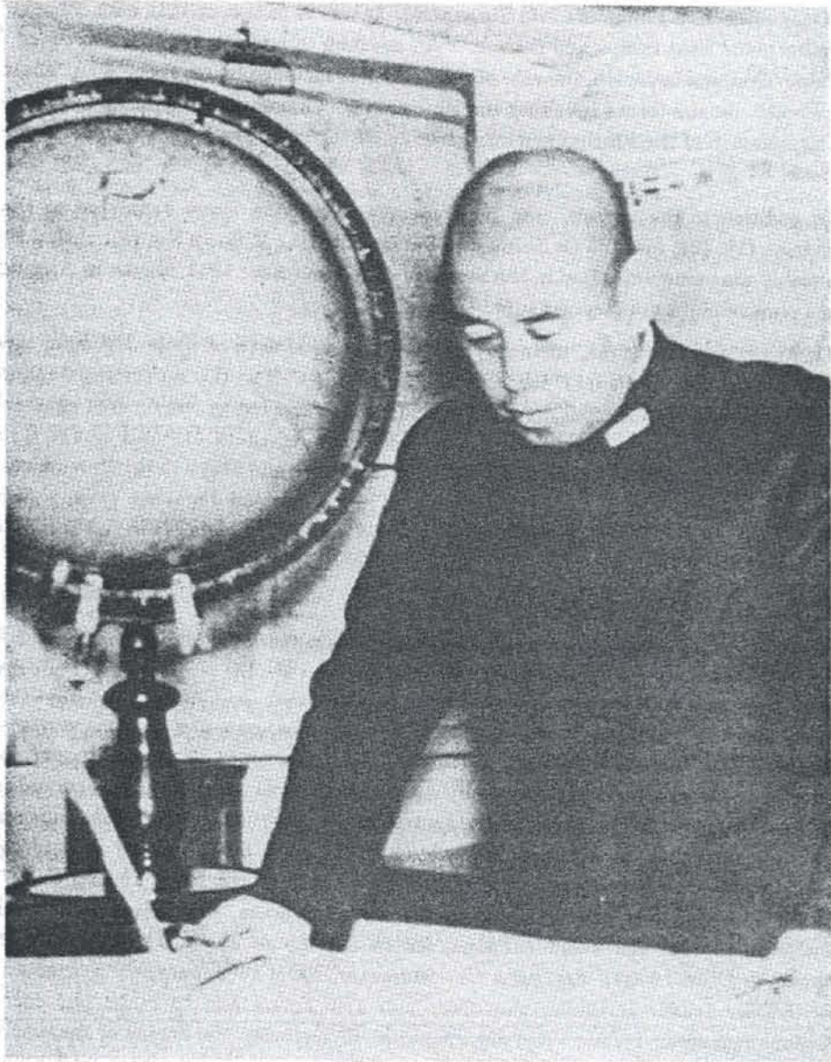
Admiral Isoroku Yamamoto, Commander-in-Chief, Combined Japanese Fleet