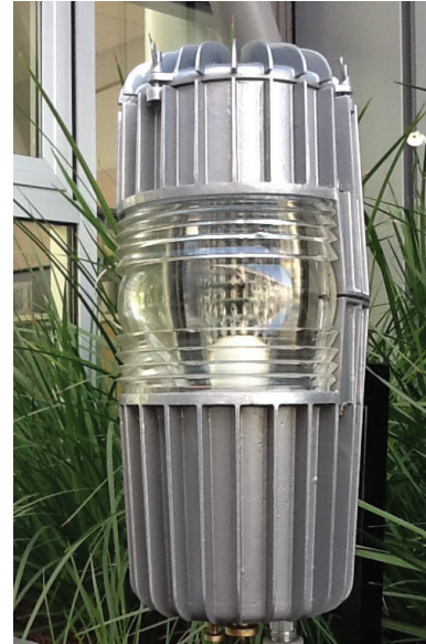
NASA Ames recently opened N232 Sustainability Base, a collaboration-enhancing facility where the Center will hone technology useful in a lunar base. "Native to Place" design principles intersect with NASA's expertise of in situ resource utilization to produce a high-performing building that strives to lead and model resource efficiency within the federal government. Reflecting the "reduce and reuse" mantra driving the design of the building, explosion-proof emergency lamps that once graced Hangar One and that nicely complement the architecture of this new green building were installed as safety lamps.