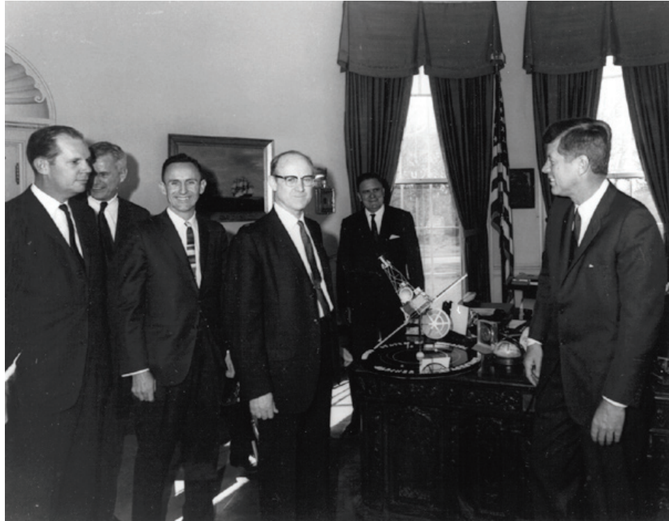
Launched on 27 August 1962, Mariner 2 became the world's first successful interplanetary spacecraft and flew within 35,000 kilometers (22,000 miles) of Venus. Dr. William H. Pickering (center), Jet Propulsion Laboratory Director, presents the Mariner spacecraft model to President John F. Kennedy (right). NASA Administrator James Webb stands directly behind the Mariner model.