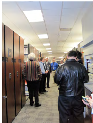
The attendees tour the GRC archive, which includes over 600 cubic feet of records.