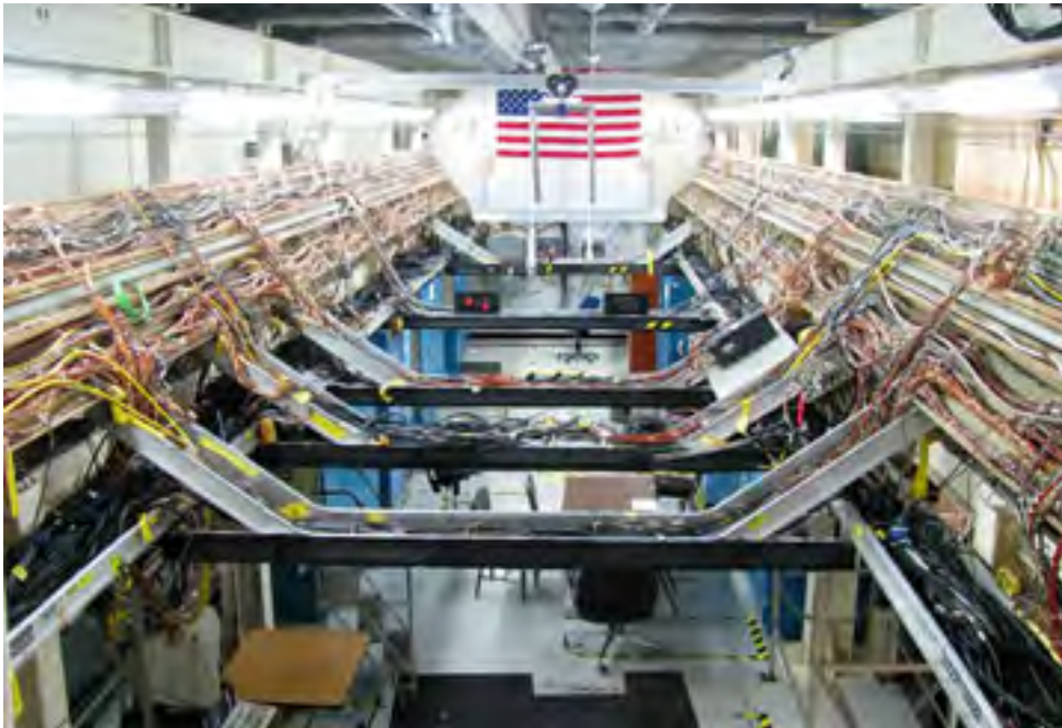
The midfuselage/payload bay area of OV-095 in SAIL.

its next assignment, supporting the Orbital Flight Test (OFT) program utilizing Columbia . Each time the development of the Space Shuttle advanced, SAIL was updated accordingly.