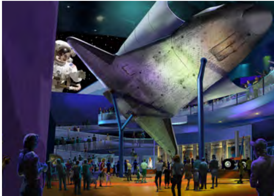
Artist's rendition of the floor-level viewing of the orbiter as it will appear in the KSC Visitor's Center.