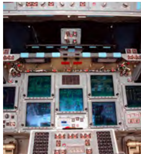
The "glass cockpit" on Space Shuttle Atlantis .