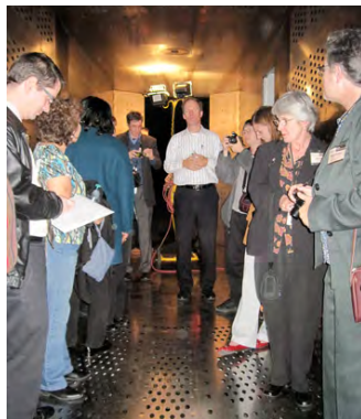
The 8' x 6' Supersonic Wind Tunnel serves as NASA's only transonic-propulsion wind tunnel, which has been in operation for over 60 years.