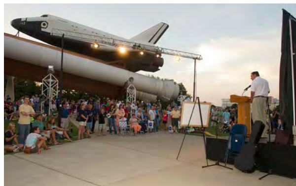
Several thousand people attended the "Salute to the Space Shuttle Program" at the U.S. Space and Rocket Center (USSRC) in August 2011.