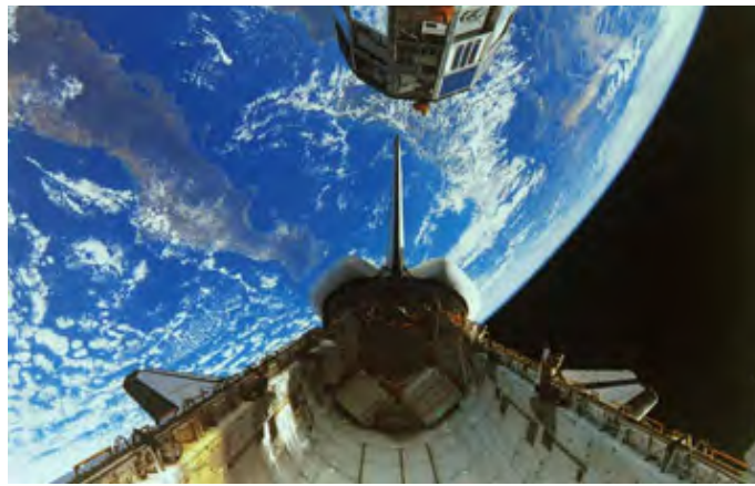
Space Shuttle deploying LDEF.