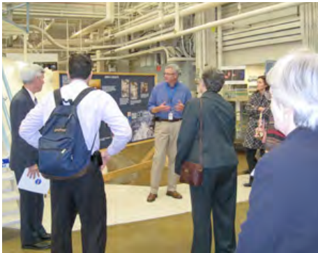
The attendees explore the Zero G Facility, the world's largest facility that provides ground-based microgravity research.