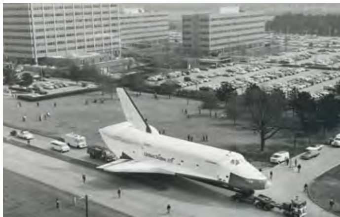
On the 25th anniversary of the Apollo 11 (the first Moon landing mission) launch, Marshall celebrated with a test firing of the Space Shuttle main engine (SSME) at the Technology Test Bed (TTB). This drew a large crowd who stood in the fields around the test site and watched as plumes of white smoke verified ignition.