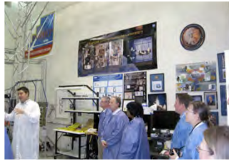
The Exercise Countermeasures Facility researches exercise protocols to prevent or minimize the health detriments for astronauts in reduced gravity as well as to optimize equipment designs for mass, volume, and spacecraft.