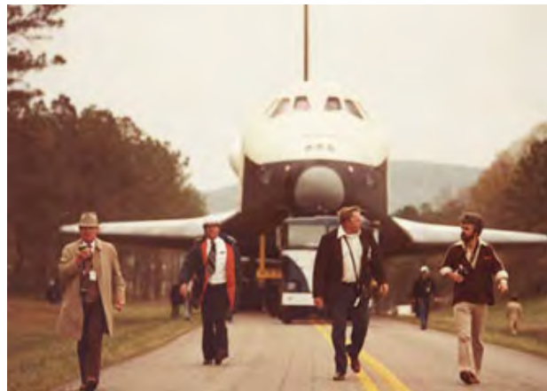
In 1978, Enterprise arrived at Marshall for vertical ground-vibration testing.