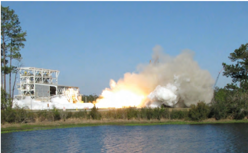
A team of engineers from NASA's John C. Stennis Space Center, Orbital Sciences Corporation, and Aerojet conducts a successful test of an Aerojet AJ26 rocket engine on 19 March. Stennis is testing AJ26 engines for Orbital Sciences to power commercial cargo missions to the International Space Station.

The initial two engines will be delivered to Orbital at the Wallops Flight Facility launch site in Virginia for integration with the Taurus II's first-stage core.