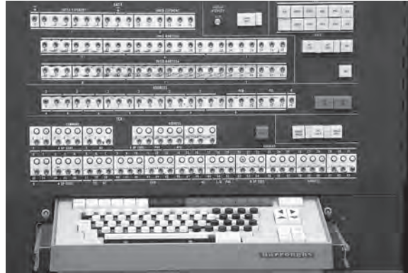
The Computer History Museum opened its new exhibit Revolution: The First 2000 Years of Computing . Among the artifacts prominently woven into that history are the ILLIAC IV massively parallel supercomputer, the Apollo Guidance Computer, and the SGI IRIS workstation for which NASA Ames was the launch customer.