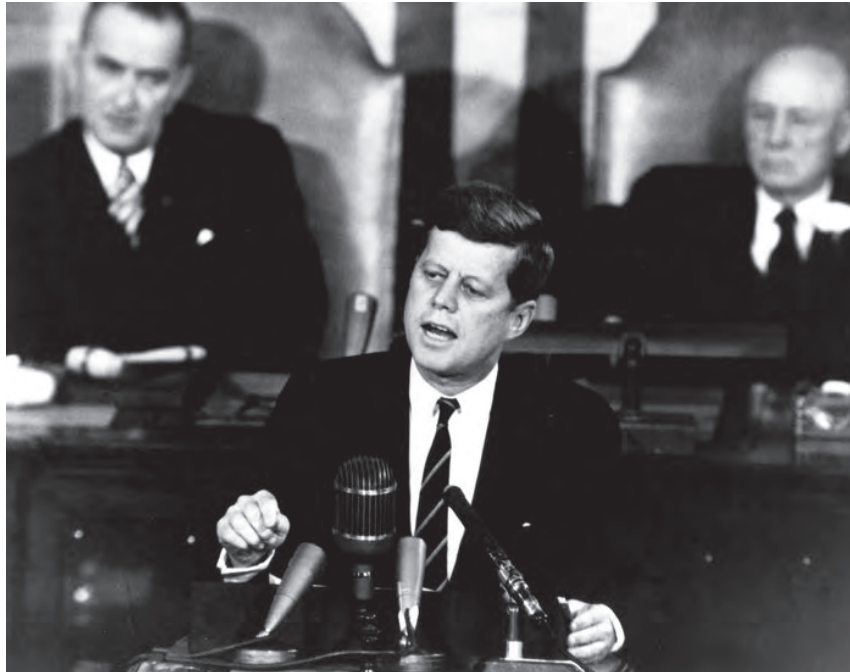
President John F. Kennedy (center), Vice President Lyndon B. Johnson (left), and Speaker of the House Sam T. Rayburn (right).

On 25 May 1961, President John F. Kennedy delivered his “Special Message to the Congress on Urgent National Needs” speech before a joint session of Congress, stating: