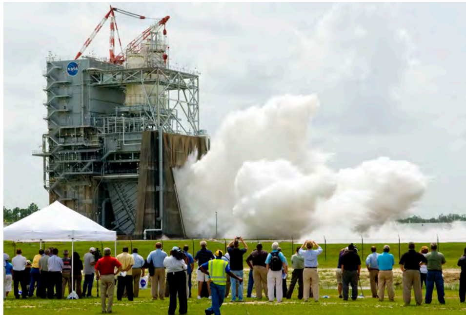
Stennis employees and guests watch the 29 July ignition of the last planned Space Shuttle main engine test on the A-2 Test Stand at the southern Mississippi facility.

space-based science laboratory; and contributing to countless spinoff technologies that continue to enhance daily life.