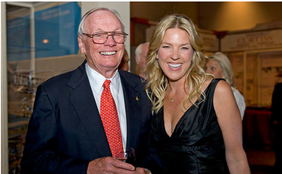
At NASA's Apollo 40th anniversary party on 20 July 2009, Neil Armstrong stands next to Diana Krall.