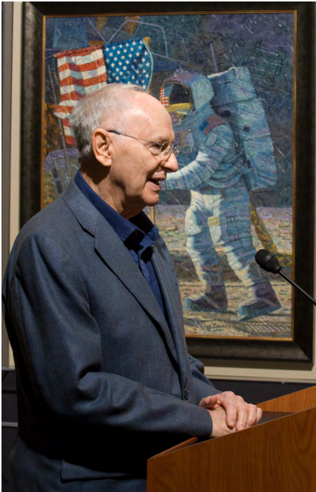
Alan Bean speaks about his paintings during a press conference on 20 July 2009.