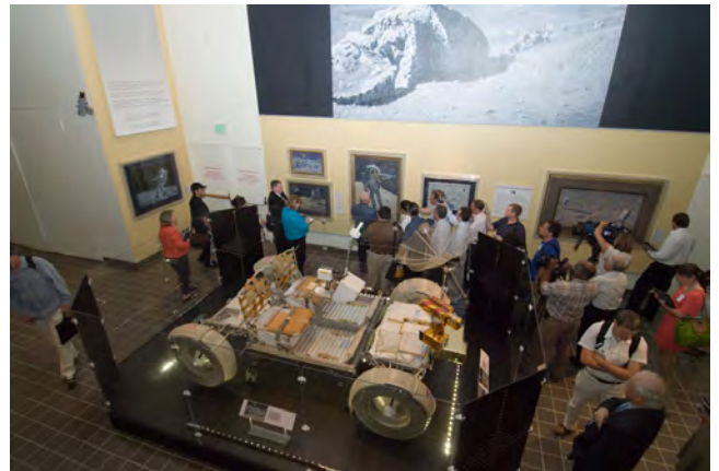
Wide-angle camera view of Alan Bean's "Painting Apollo: First Artist on Another World" exhibit, 20 July 2009.