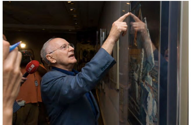
On 20 July 2009, Alan Bean shows an image from his exhibit, "Painting Apollo: First Artist on Another World."