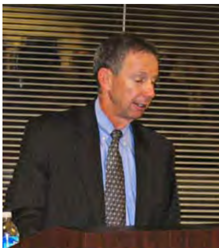
NASA Administrator Michael Griffin addresses reception attendees.