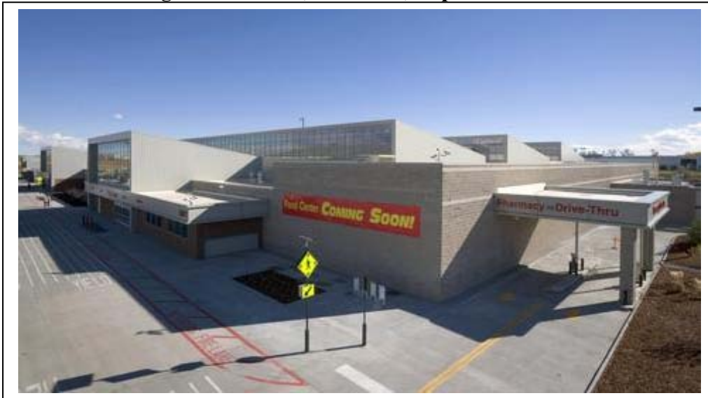
Figure 1. Aurora, Colorado, Experimental Store

energy systems. This paper presents the major energy system experiments in HVAC, refrigeration, lighting, and renewable energy generation at the Colorado experimental store.