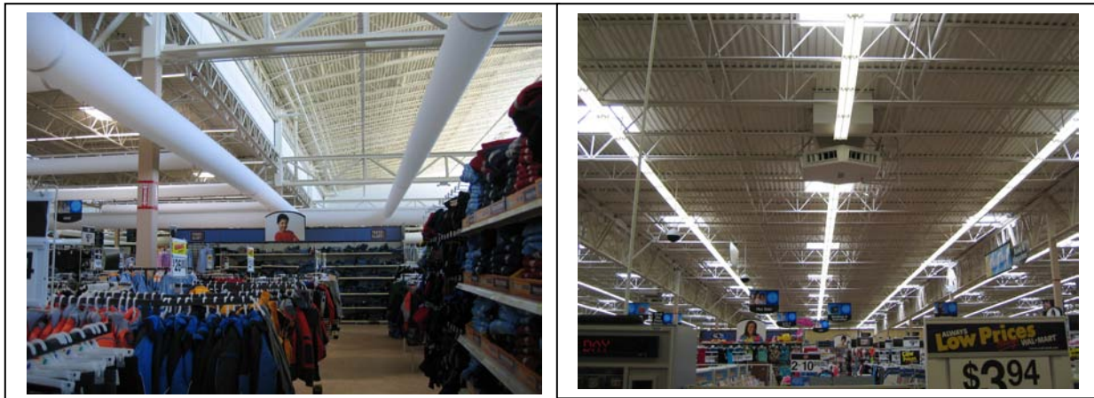
Figure 2. Daylighting in the Colorado Experimental (left) and Reference (right) Stores

The reference supercenter sales floor lighting layout used rows of two, 4-ft T-8 lamp fixtures 12 ft apart and skylights installed at a 3.9% skylight to floor area ratio (see Figure 2). The installed lighting power density (LPD) was 1.3 W/ft 2 . The lights were dimmed to 20%, then turned off when natural light was adequate to meet the illuminance set point of 50 fc (500 lux). The experimental store lighting system experiments are listed in Table 3. The roof architecture of the experimental store incorporated three large sawtooth structures forming north-facing clerestory windows (see Figures 1 and 2). Skylights were included between these structures and in other areas of the store not served by the clerestory windows. The sales floor light fixtures used one, 5-ft high-output T-5 lamp. The lamps were dimmed to 20%, then turned off with available natural light. In both stores, the lights were controlled through the energy management system by one light sensor located in a skylight looking up at the sky. The control systems were calibrated to maintain the illuminance at approximately 50 fc (500 lux). The reference store sales floor was controlled as one large zone, and the experimental store was controlled as three zones because of the light and dark areas created by the sawtooth roof structure.