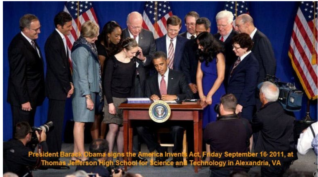
President Barack Obama signs the America Invents Act, Friday September 16, 2011, at Thomas Jefferson High School for Science and Technology in Alexandria, VA