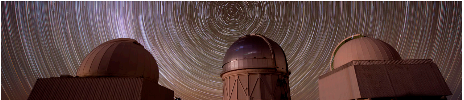
This photo of the Cerro Tololo Inter-American Observatory in Chile was made by overlaying dozens of photographs atop one another.

For more information, visit www.darkenergysurvey.org . To see the first images from the camera, go to http://1.usa.gov/PLPFDQ .