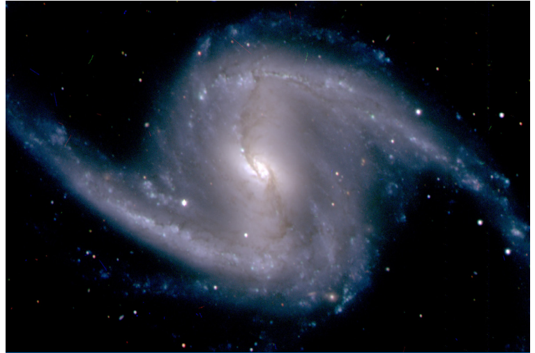
One of the first images taken with the Dark Energy Camera, of the barred spiral galaxy NGC1365, which is 60 million light years from Earth.

As the name implies, the Dark Energy Survey will hopefully help us understand the force we call Dark Energy. Scientists have discovered that the universe is expanding faster and faster. Gravity should cause that expansion to slow, but instead it's speeding up. The Dark Energy Survey will help us understand why. The answer is likely to change our understanding of the forces, including gravity, that cause everything in the universe to interact.