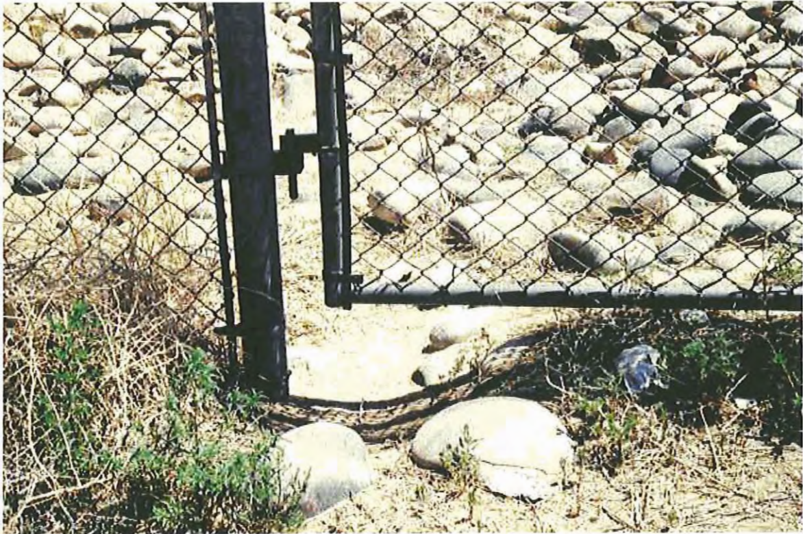
PL-1. Potential Site Entry Point beneath the Access Gate