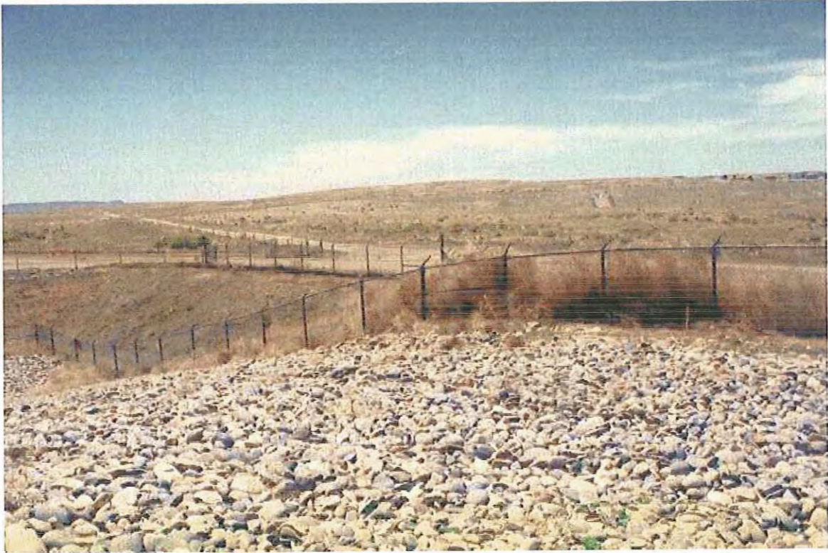
PL-1. Tumbleweed Accumulation Along West Fence Line