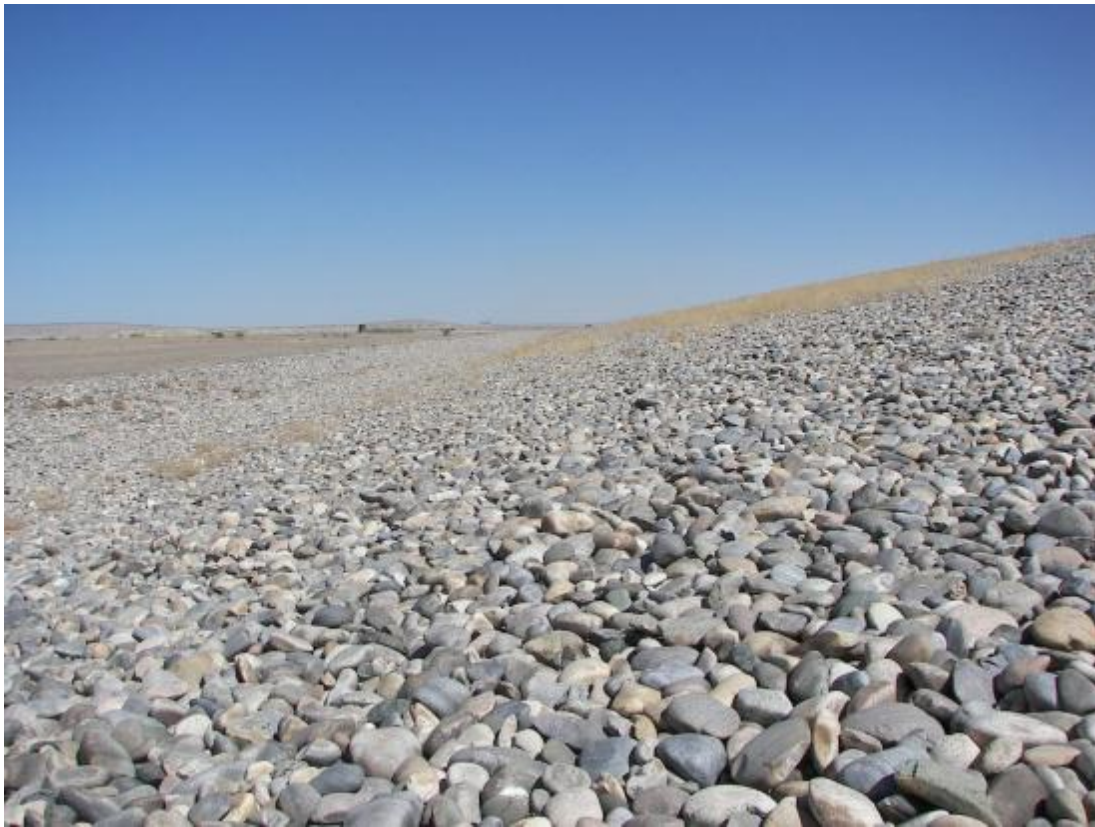
SHP 5/2012. PL-9. Side slope of disposal cell, view east.