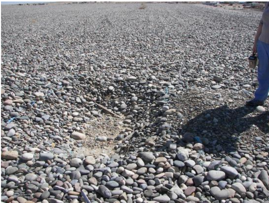
SHP 5/2012. PL-10. Open test pit on western portion of cell.