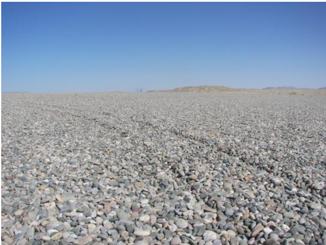
SHP 5/2012. PL-12. Vehicle tracks visible on disposal cell cover, southwest portion of cell.