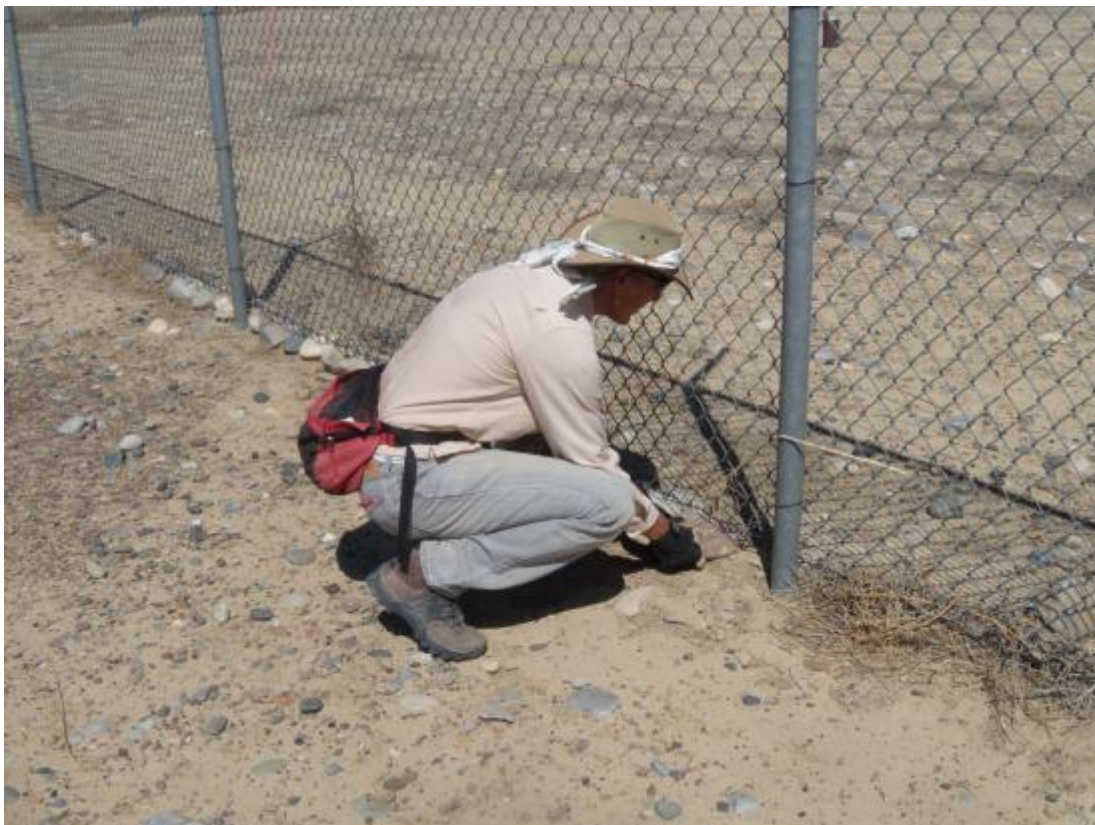
SHP 5/2012. PL-6. Placing rocks in hole under perimeter fence.