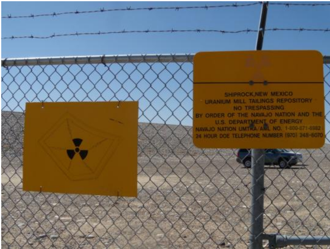
SHP 5/2012. PL-1. New entrance sign at east gate.