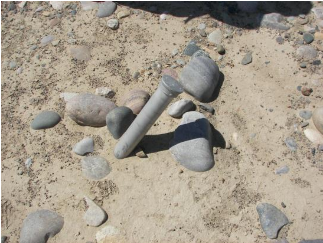
SHP 5/2012. PL-8. Erosion control marker damaged but functional.