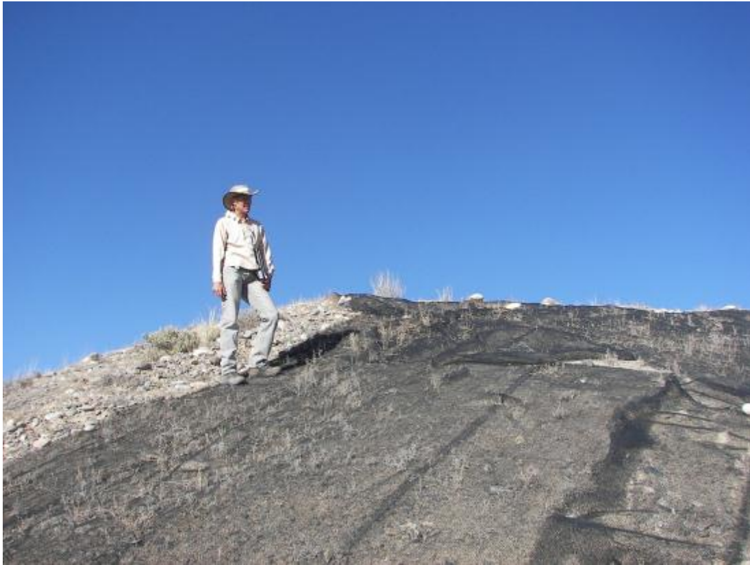
SHP 5/2012. PL-15. Erosion control fabric along outflow channel.