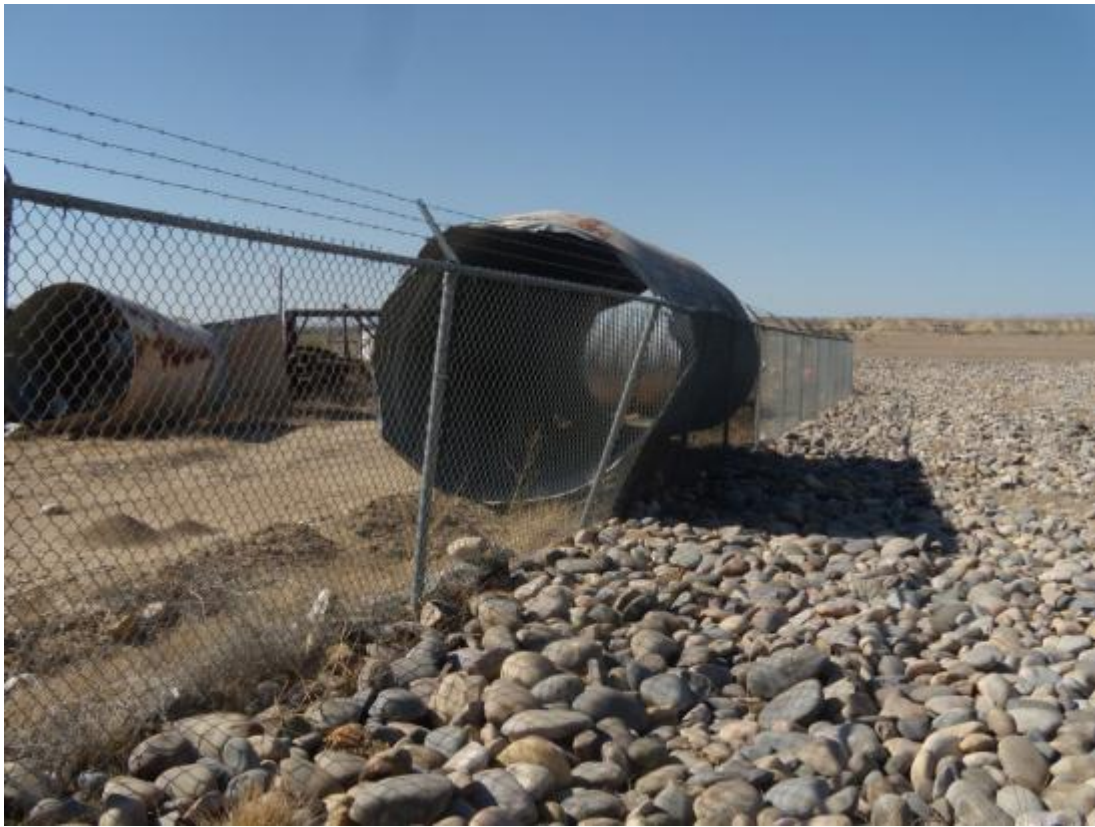
SHP 5/2012. PL-5. Bent fence (still intact) from large culvert in NECA yard near perimeter sign P13.