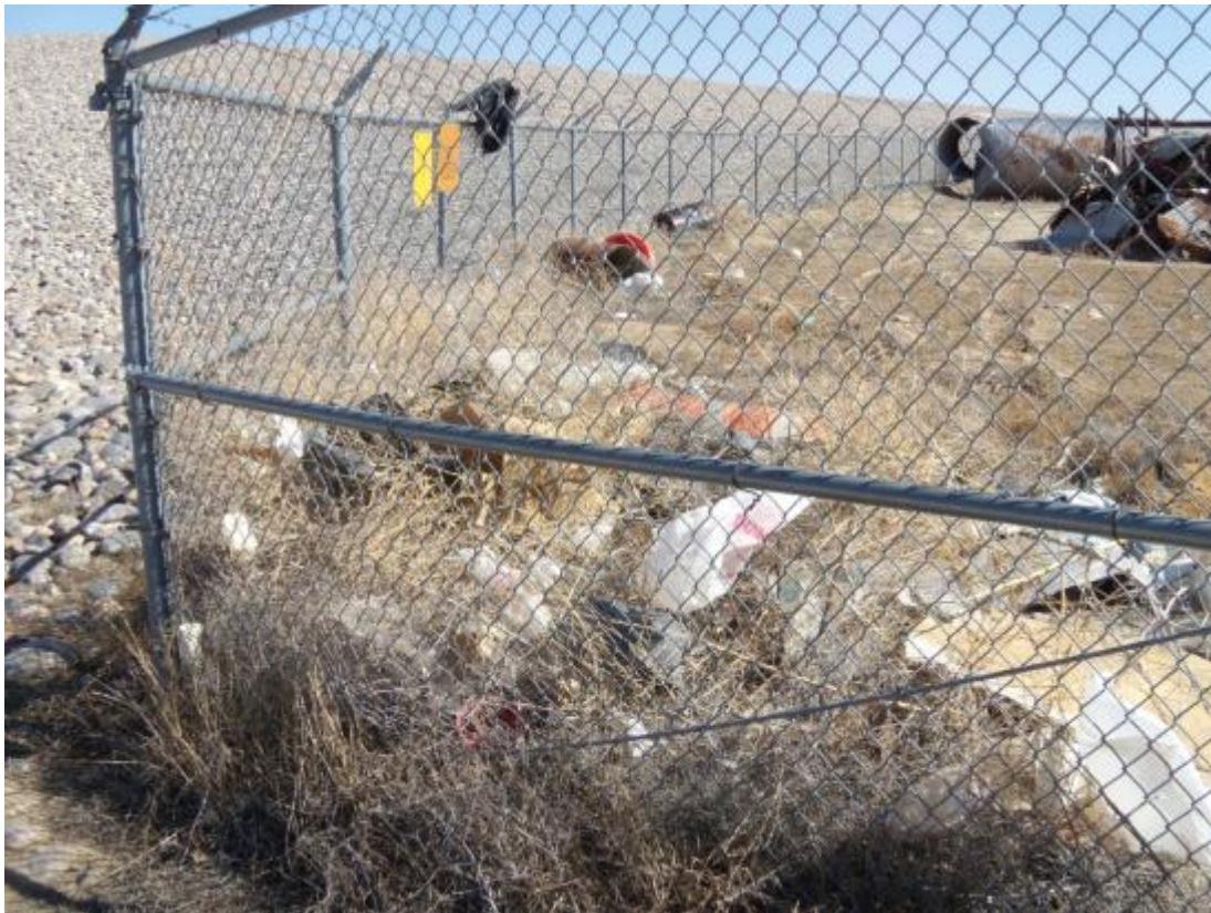
SHP 5/2012. PL-3. Trash and tumbleweed buildup in fence corner by perimeter sign P14.