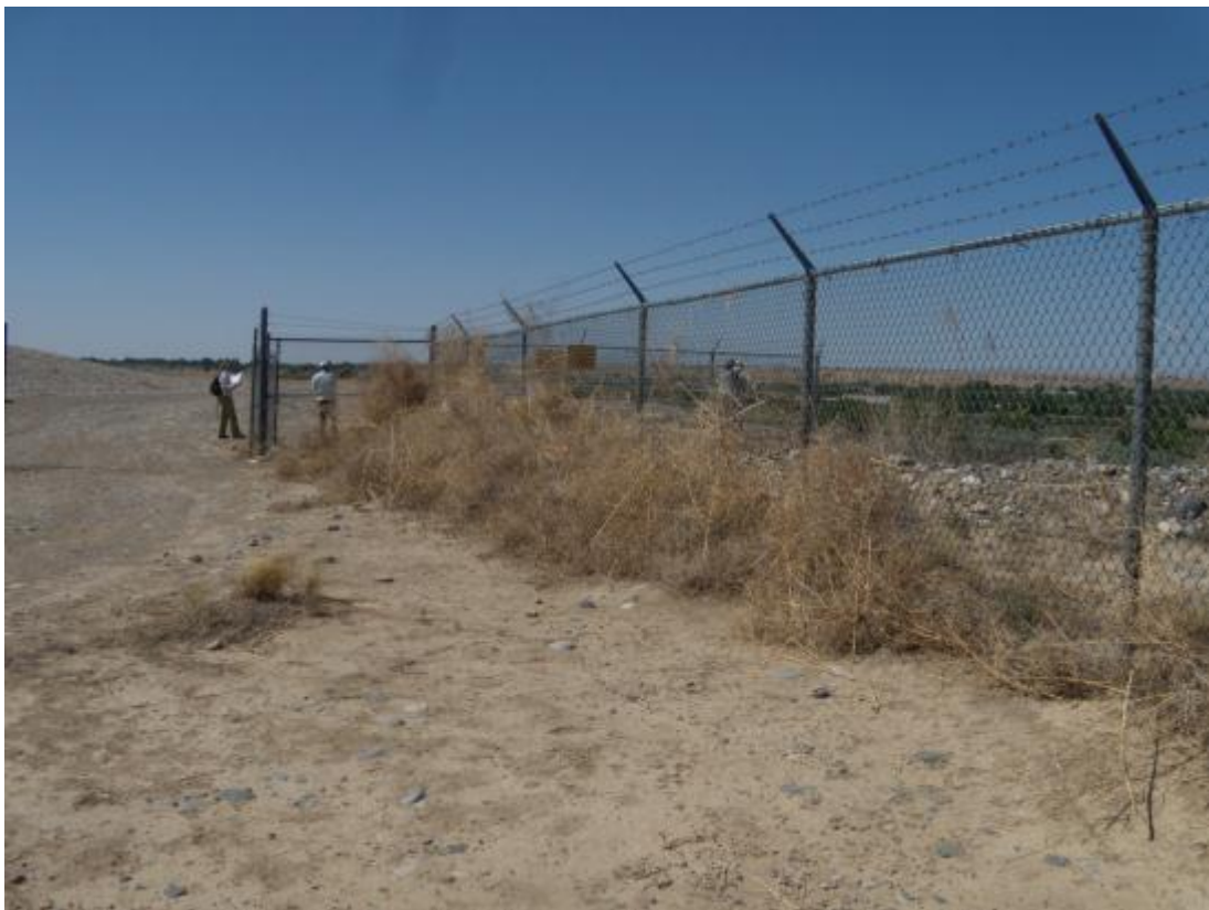
SHP 5/2012. PL-4. Tumbleweed buildup near the east gate.