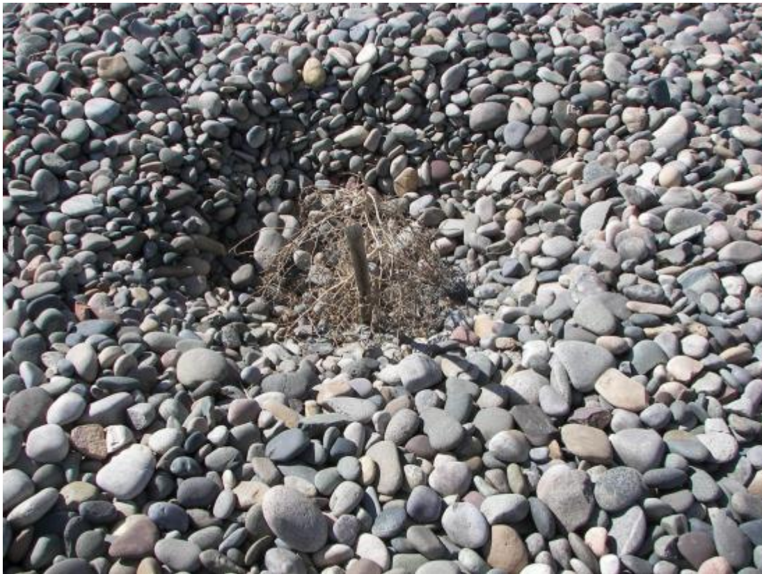
SHP 5/2012. PL-11. Historical test pit on eastern edge of cell.