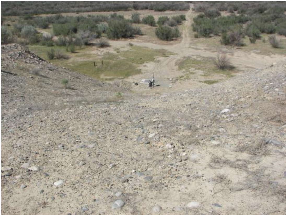
SHP 5/2012. PL-14. Section of escarpment near survey monument SM-1.