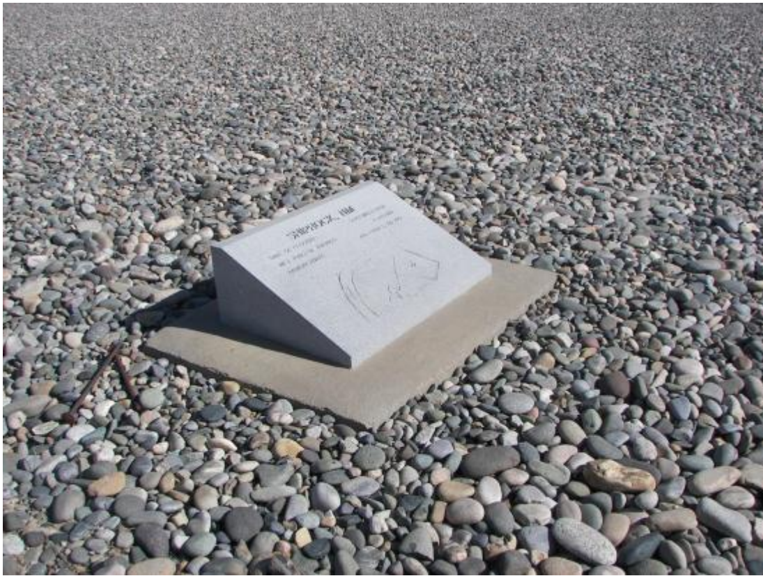
SHP 5/2012. PL-7. Site marker SMK-2.