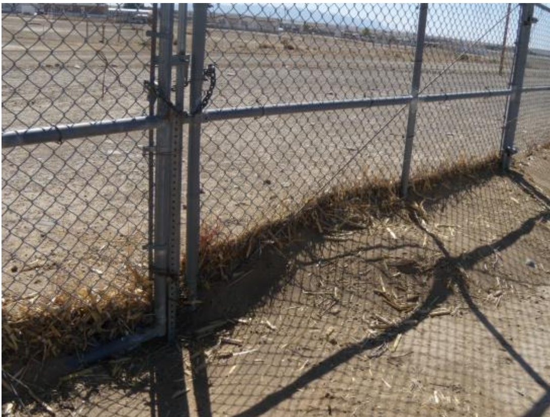
SHP 5/2011. PL-2. Sediment buildup along southwest gate.