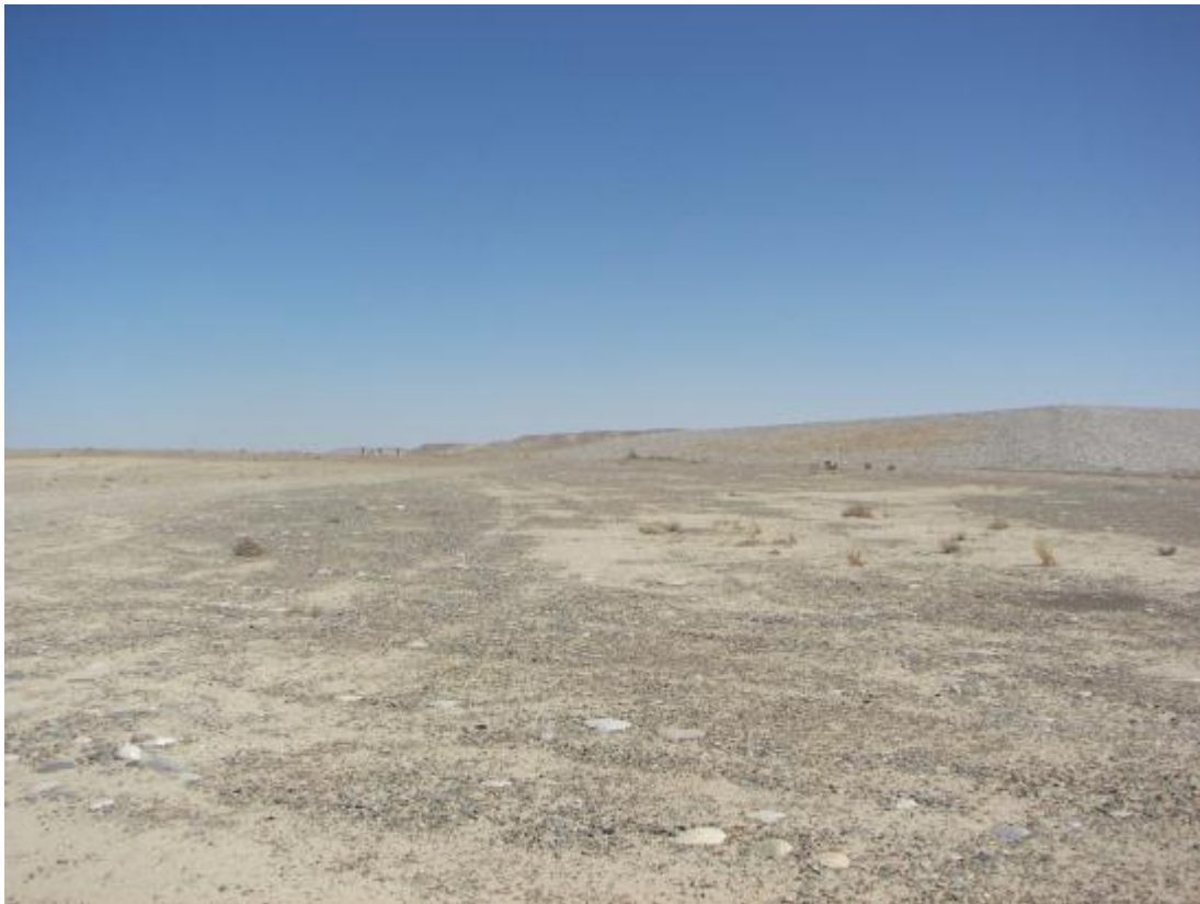
SHP 5/2012. PL-13. View of terrace from the northern phytoremediation test plot.