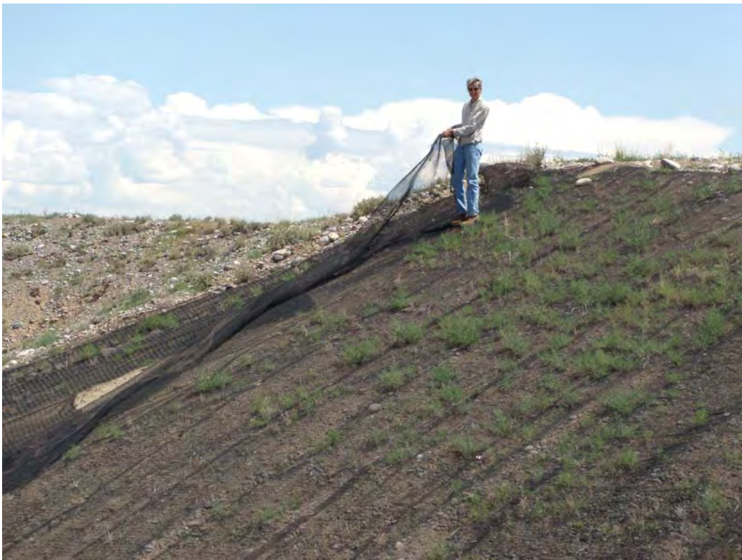
SHP 5/09. PL-4. Loose erosion fabric on the slope of the hill above the outflow channel.