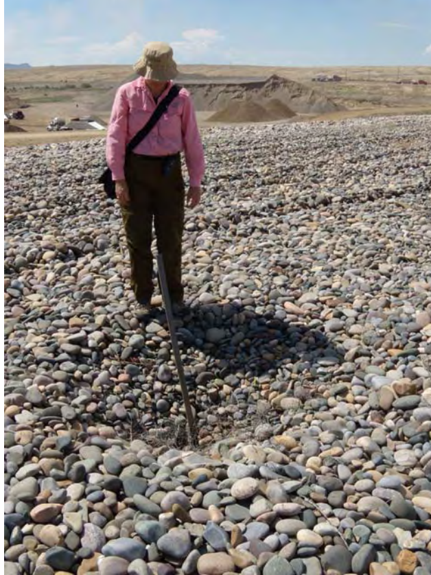
SHP 5/09. PL-1. Conical depression found on top of the disposal cell.