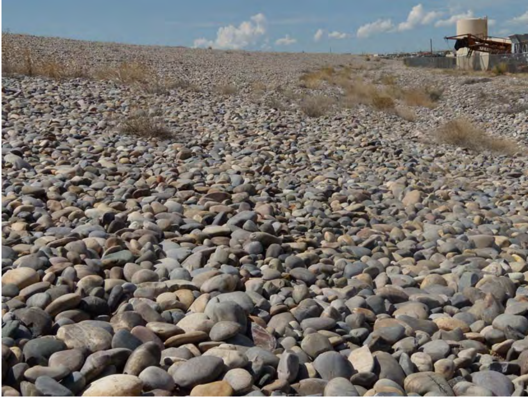
SHP 5/09. PL-3. Dead vegetation on the disposal cell slopes and drainage channel.