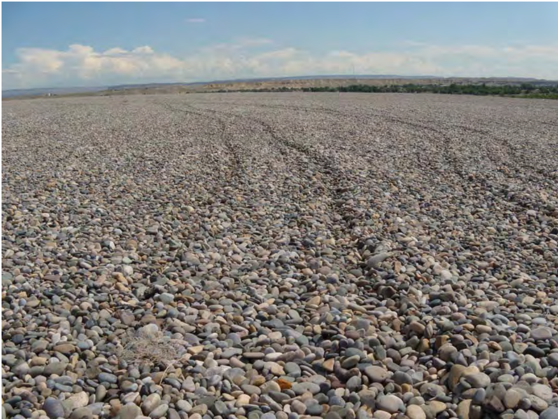
SHP 5/09. PL-2. Vehicle ruts on the surface of the disposal cell.