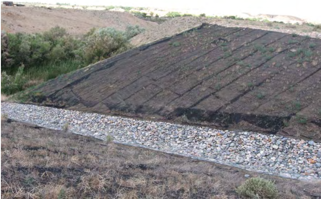
SHP 6/2010. PL-5. Loose erosion fabric on slope of hill above outflow channel.