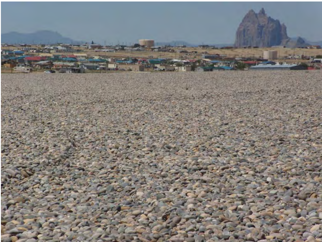
SHP 6/2010. PL-4. Disposal cell cover showing vehicle ruts and dead vegetation.