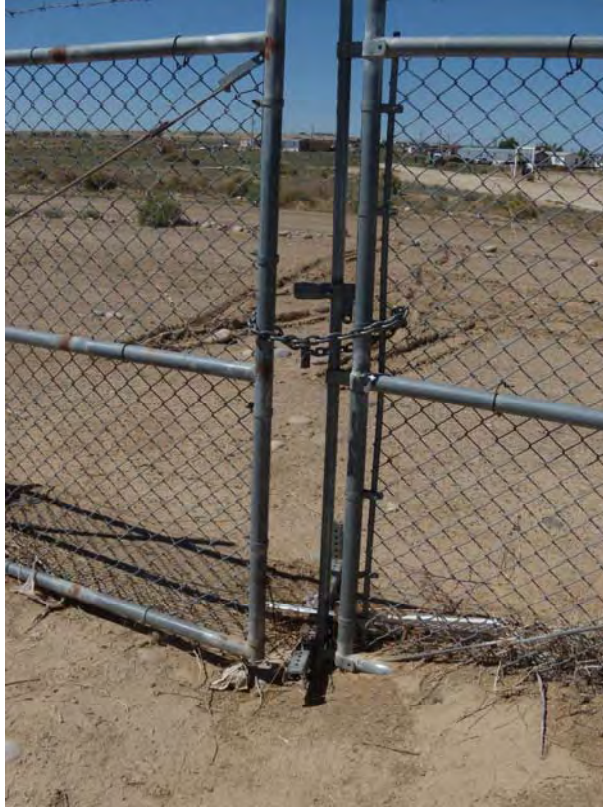
SHP 6/2010. PL-1. Vertical gap approximately 6 inches wide in west access gate.