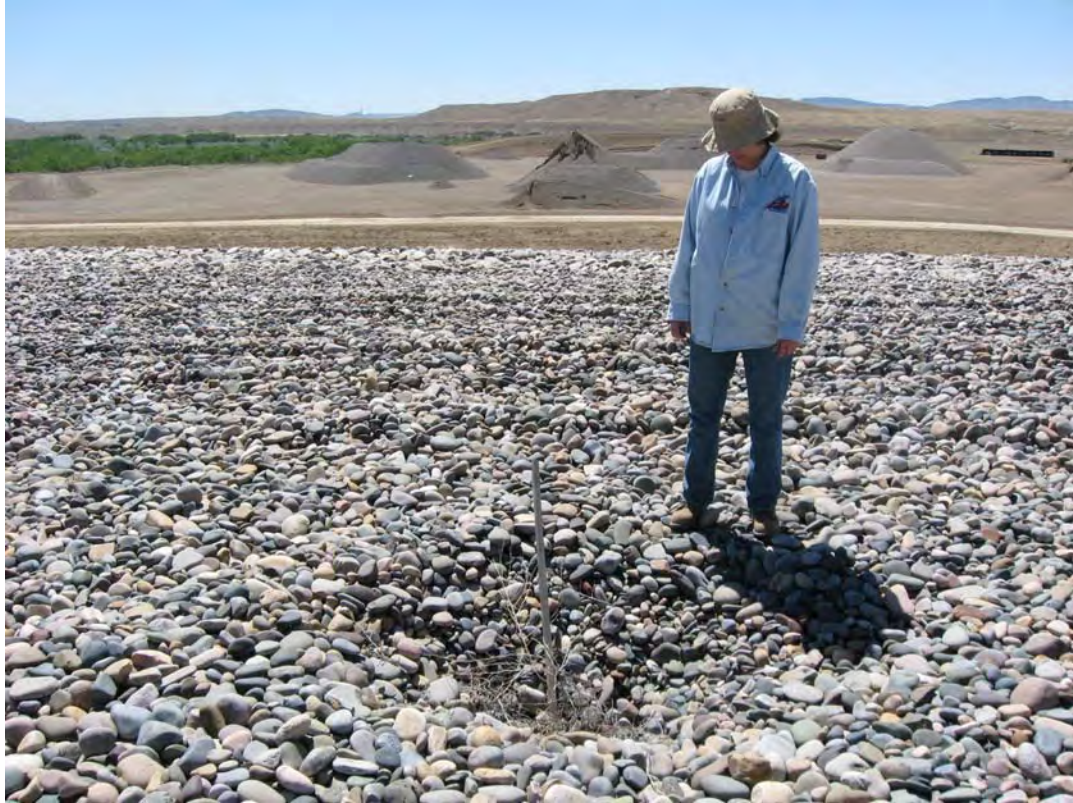
SHP 6/2010. PL-3. Historical test pit on disposal cell cover .