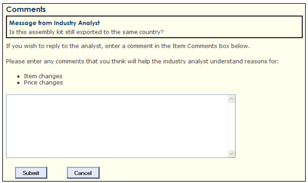
Message from Industry Analyst Screen