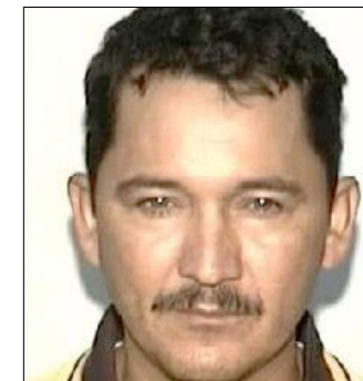
Waldemar Lorenzana Cordon

$200,000 Reward Offer from the U.S. Government