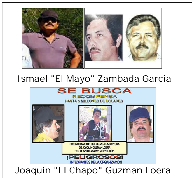
Ismael "El Mayo" Zambada Garcia

Department of the Treasury Office of Foreign Assets Control