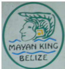
MAYAN KING LTD Dangriga, Belize Tax ID GST-DGA 015476