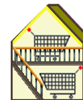
D'S SUPERMARKET COMPANY LTD Corozal, Belize