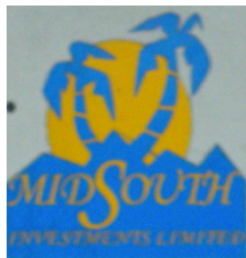
MID-SOUTH INVESTMENTS LTD Dangriga, Belize