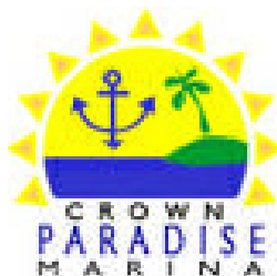
CROWN PARADISE ENTERPRISES LTD Dangriga, Belize