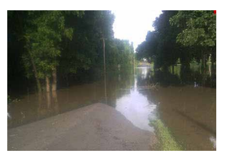
Bird Creek in Oklahoma continue to have a flooding problem. Here it overflows the road.

The Willapa Harbor Station was equipped with a Tipping Bucket rain gauge, anemometer, wind vane, sunshine recorder, and hygrothermograph. At the age of 83,