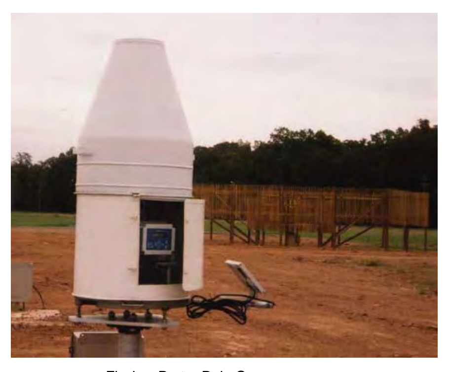
Fischer-Porter Rain Gauge

in the state is a site called Pa'akea on the island of Maui. The technicians who install the equipment are working to ensure the precipitation records are accurate, reliable and available for climatologists for years to come.