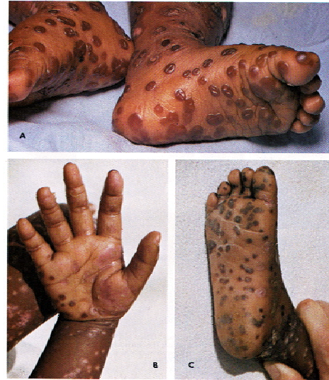
Fig. 2 – Upper picture: lesions on the sole on 14 th day of rash. Lower picture: lesions on palm and sole on 21 st day of rash. Note, scabs on other visible areas of arm and leg have separated, however, lesions on palms and soles remained as dark disc-like scabs. (From Fenner F, Henderson DA, Arita I, Ježek Z, Ladnyi ID. Smallpox and its eradication . Geneva, Switzerland: World Health Organization; 1988.)