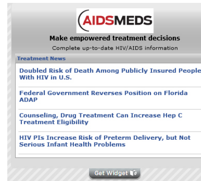
AIDSmeds widget, Widgetbox.com

Spread the word and promote your widget. Ask other blogs and your peers to embed your widget in their website or blog.