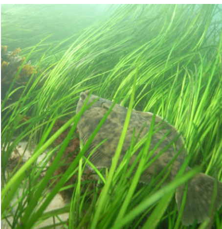
Winter flounder in eelgrass habitat.