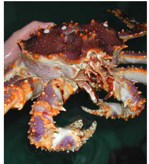
Female blue king crab. Blue king crab are not totally blue, but have much more blue color than red king crabs.