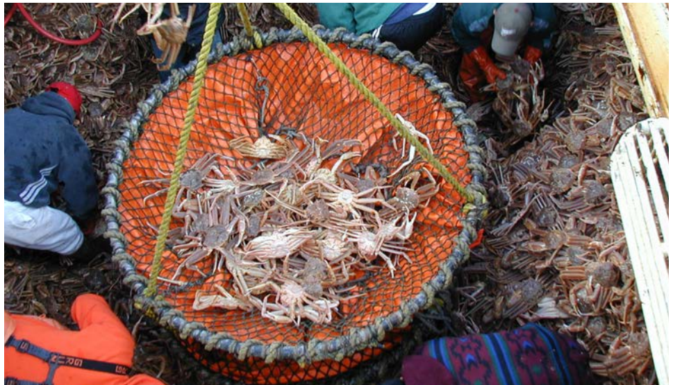
Bering Sea snow crab being off-loaded for processing in Dutch Harbor, Alaska.

NOAA Fisheries releases the 15th Annual Report to Congress on the Status of the Nation's Fisheries. This report documents our national journey toward ending overfishing and rebuilding the nation's fisheries.