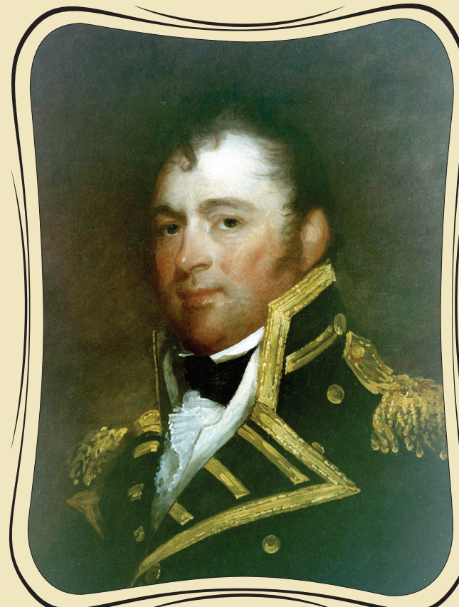
Captain Isaac Chauncey commanded the New York Navy Yard during the first months of the War of 1812.

Just as the war was drawing to a close in 1815, New Yorkers witnessed the launching of the U.S. Navy's first steam-powered warship, the floating battery Demologos or Fulton I , designed by Robert Fulton for the defense of New York Harbor. Not long after, the city hailed the arrival of USS Constitution as the frigate returned to America after its spectacular victory over two enemy ships, Cyane and Levant , in a single engagement.