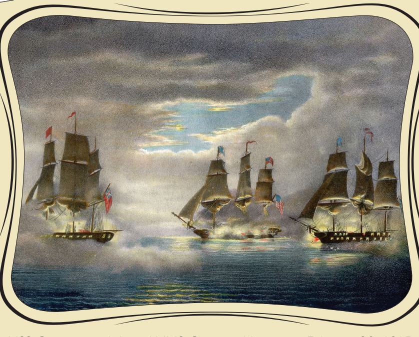
USS Constitution defeated HMS Cyane and Levant on February 20, 1815.