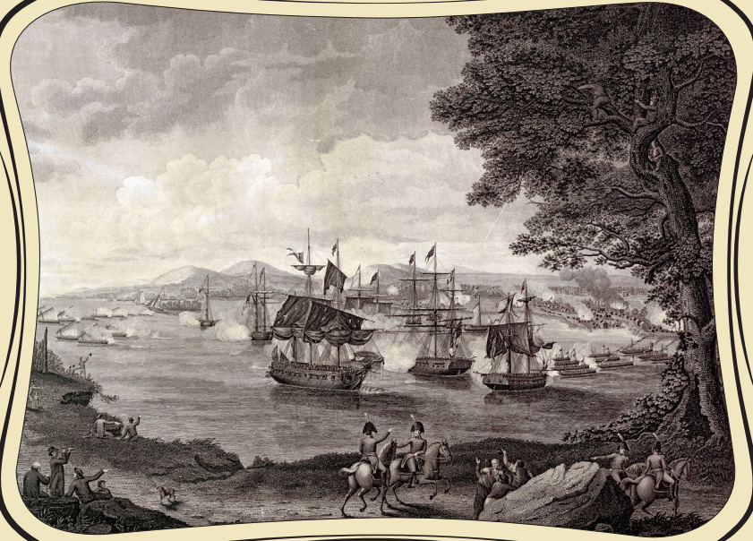
The New York Navy Yard supplied the American fleet on Lake Champlain. The American victory there on September 11, 1814, was a turning point in the war.