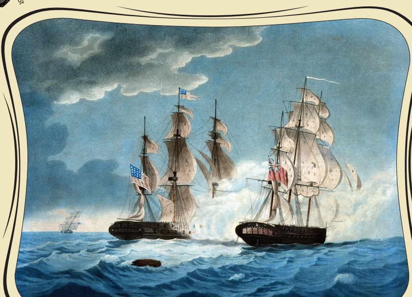
USS President captured by a British squadron while attempting to escape New York Harbor, January 15, 1815.

President Thomas Jefferson signed legislation establishing the U.S. Coast Survey in 1807, tasking it with creating charts of the nation's coastal waters so America's young shipping industry could thrive. Today, America's coastal waters remain as central to the nation's prosperity as they were 200 years ago, and mariners continue to trust the accuracy and precision of the nation's navigational charts, still provided by NOAA's Office of Coast Survey.