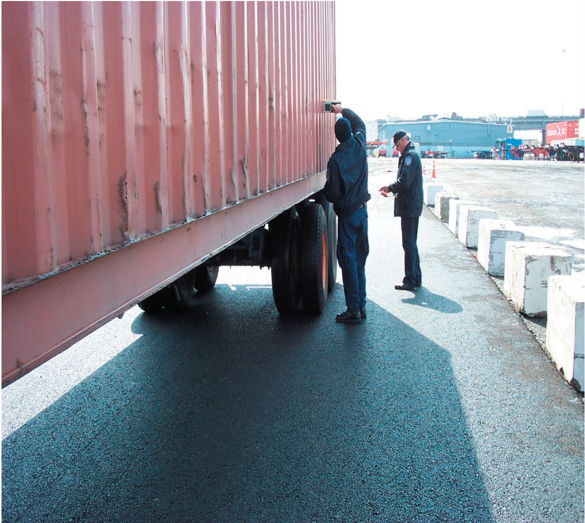
Inspector using a Radiation Isotope Identification Device on an oceangoing container that is loaded onto a truck chassis.