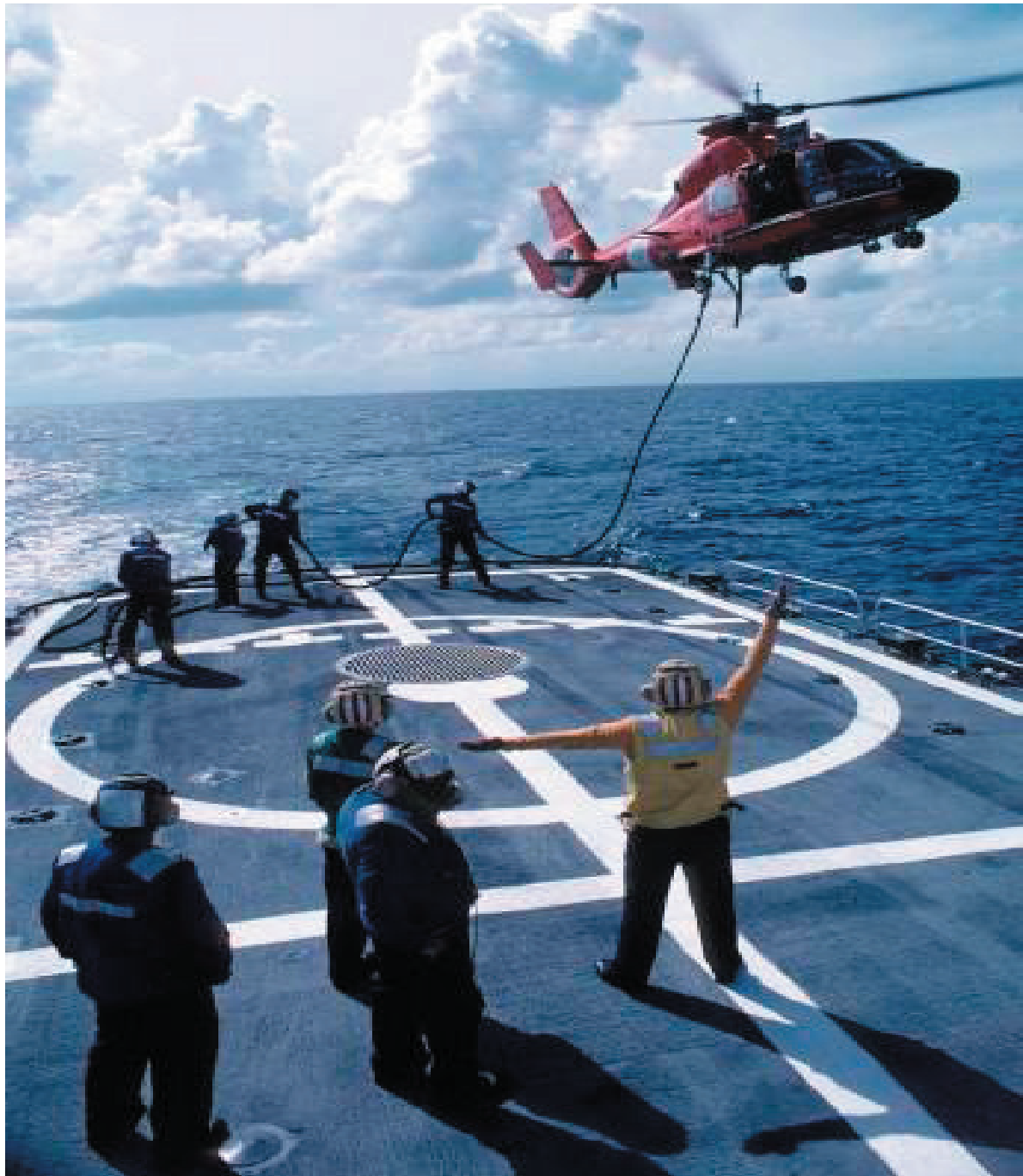
HH-65A Conducting HIFR operations with a Coast guard Medium Endurance Cutter