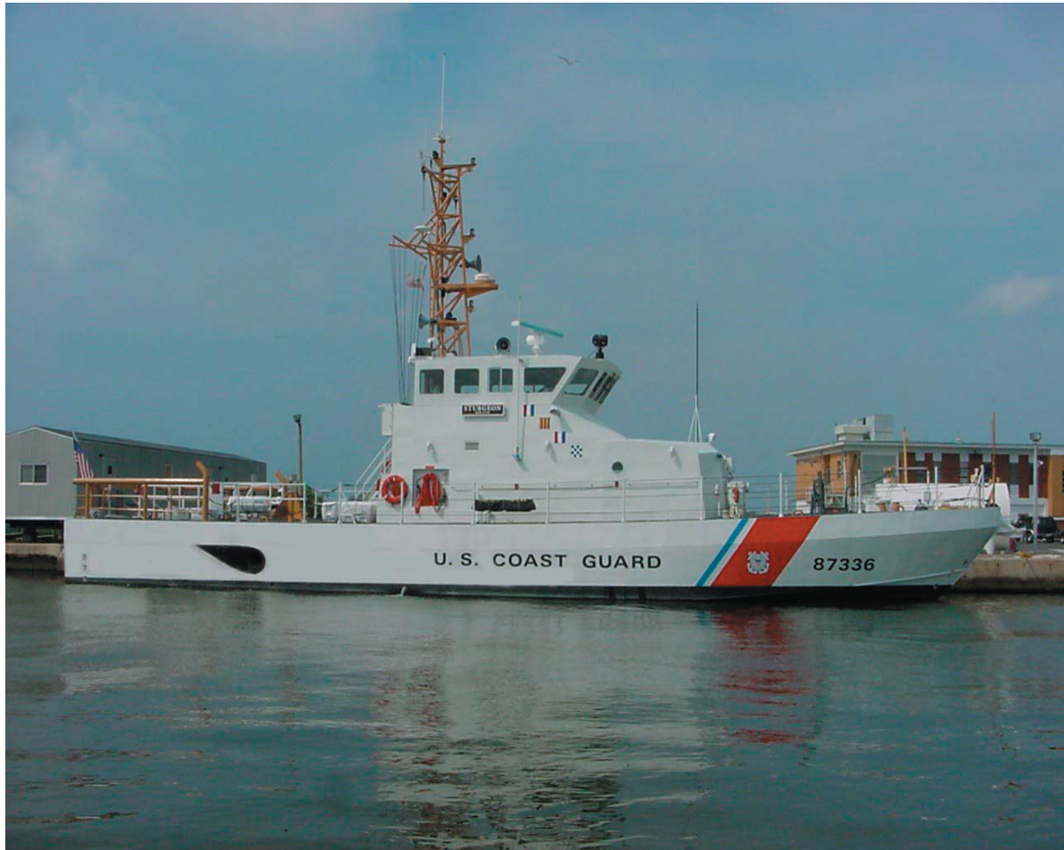
USCGC Sturgeon WPB – 87336, 87-Foot coastal Patrol Boat