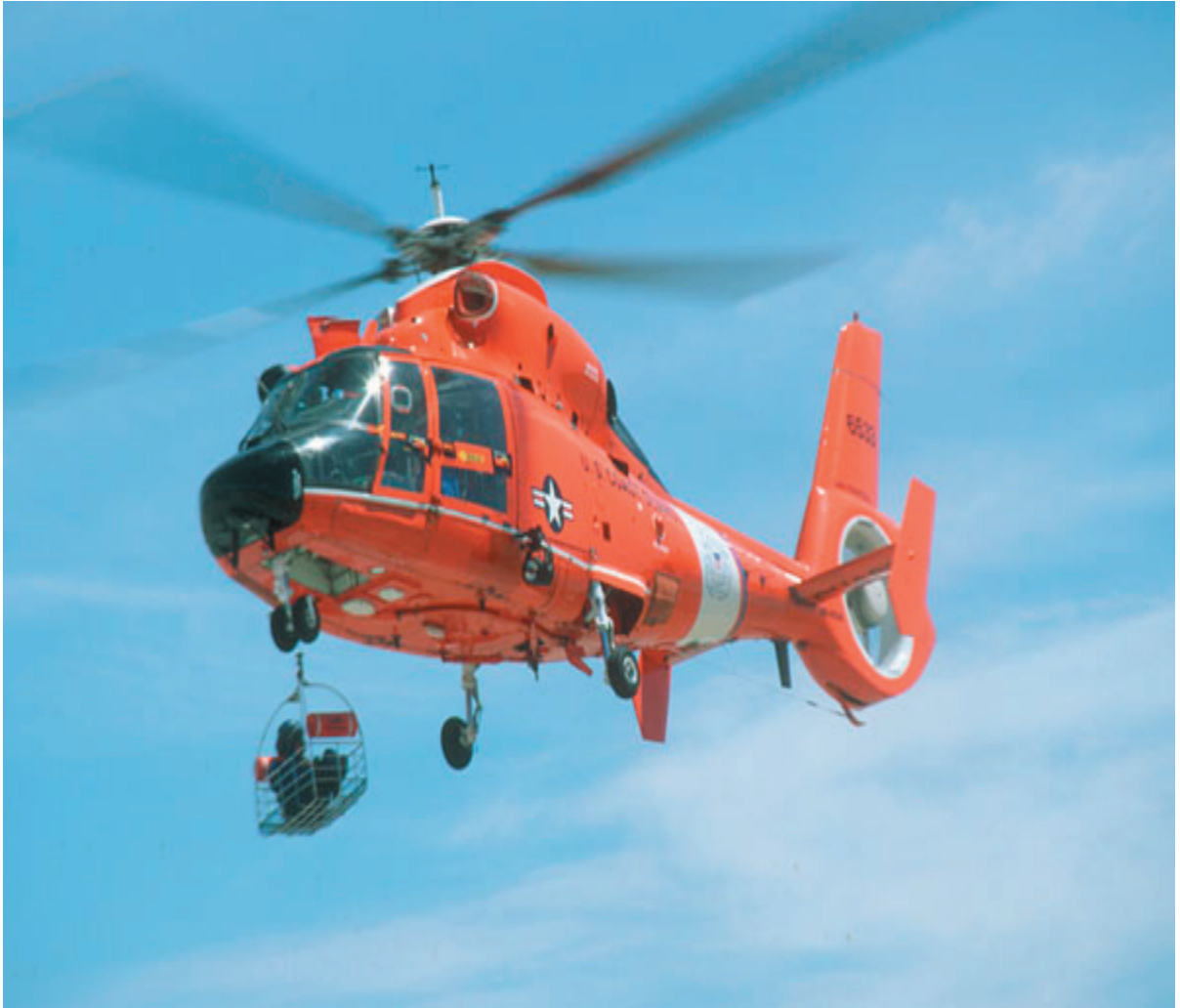
HH-65 on a Search and Rescue Training Mission