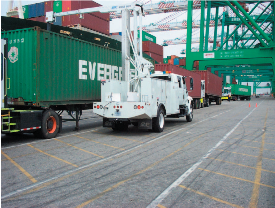
Mobile Vehicle and Cargo Inspection System examining oceangoing cargo containers at Long Beach (shows cranes and containers stacked on ship in background)