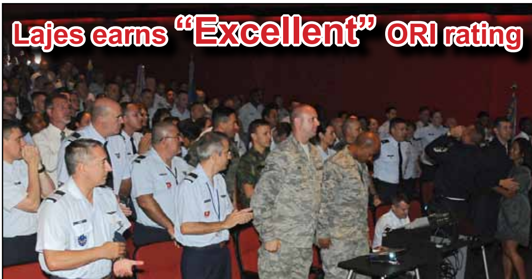
Lajes "A"irmen and their Portuguese counterparts applaud as the U.S. Air Forces in Europe's Inspector General's team announces the overall "Excellent" rating for the 65th Air Base Wing during the Operational Readiness Inspection out-brief Sept. 19, 2011.

By Staff Sgt. Olufemi Owolabi 65th Air Base Wing Public Affairs