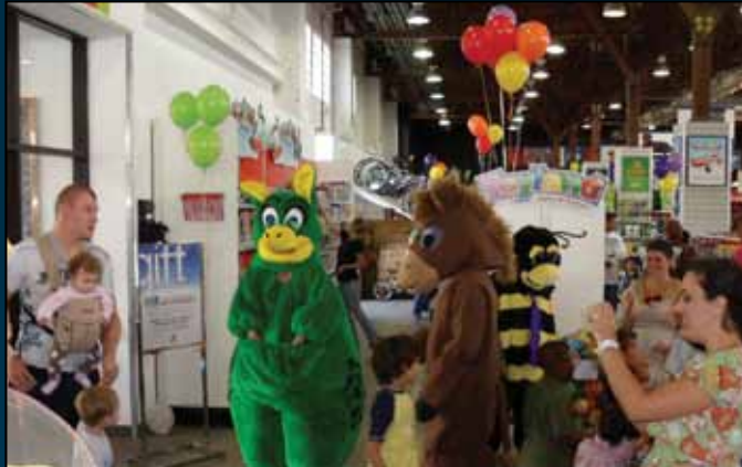
Lajes members and their families attend the Toyland grand opening Sept. 25, 2011 at the Base Exchange.