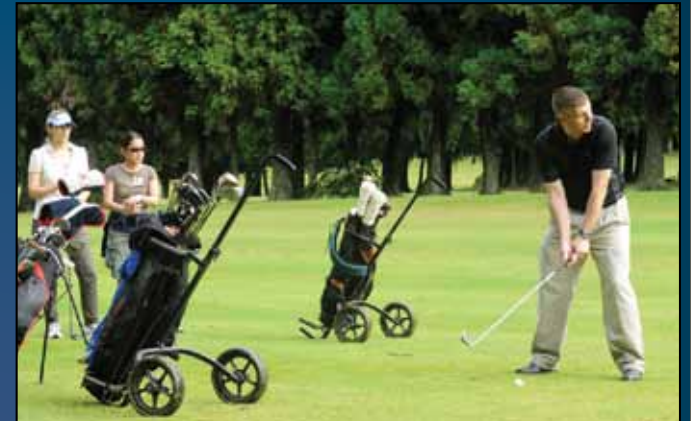
Col. David Parr, 65th Air Base Wing vice commander, swings at a golf ball during the post-operational readiness inspection golf tournament Sept. 23, 2011. The tournament was held after the Lajes 2011 ORI and Limited Unit Compliance Inspection which was held Sept. 12- 16. When the results of the inspection were announced, the 65th ABW received an "Excellent" rating.