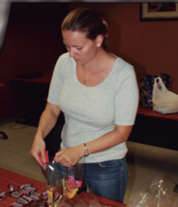
Spouses contribute to exercise.