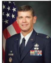
Col. Jose Rivera

The Commander's Action Line is your link to the commander for suggestions, kudos and as a way to work problems or issues within the 65th Air Base Wing for which you can't find another solution. Your chain of command should always be your first option — but when that's not the answer, call or e-mail the Commander's Action Line at 535-4240 or 65abw.actionline@lajes.af.mil .