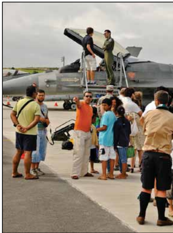
A local national gets an explanation about an F-16 from a Portuguese airman during the Open House Day July 10. The open house, gave the local Portuguese community an opportunity to visit Lajes Field to get a firsthand view of military life on base.