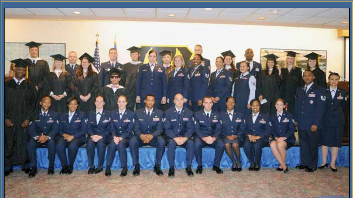
Graduates from the Lajes Community College of the Air Force as well as graduates from other colleges, pose for a group photo after the commencement ceremony held at the Top of the Rock Club June 2011. Thirty-two Lajes students graduated during the ceremony.

helpful. Again, take a look at the website next time a legal need arises, and feel free to visit the JA office during our legal assistance hours of 9 a.m. to 3 p.m. Monday thru Friday, or call 535-3546 if those times don't work for you. We value your feedback concerning the website and the services we provide as we continue to look for ways to better serve you. See you soon – and don't forget your ticket number!