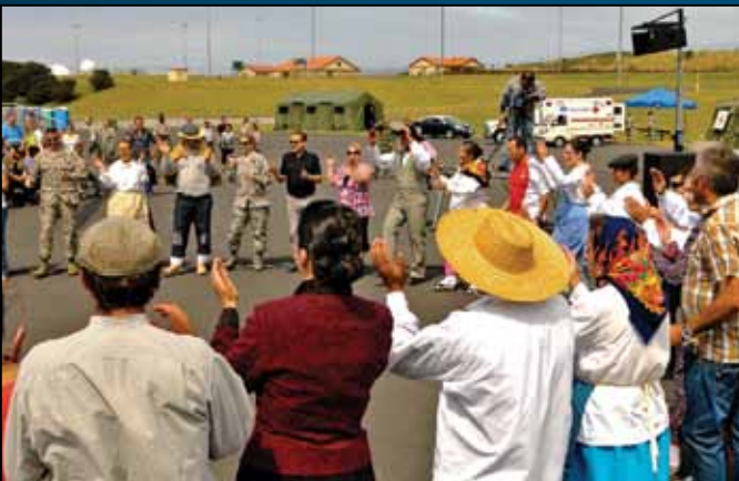
Members of the "Cantares da Eira," a local folklore band from Vila das Lajes, dance with members of the 65th Air Base Wing and local nationals in a traditional song, called "Balancé," during the open house July 10, 2011.