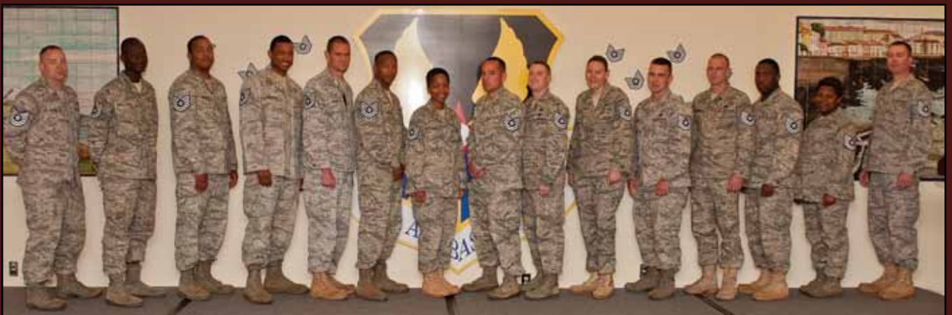
Fifteen Lajes technical sergeant selectees pose for a group photo during the Tech. Sgt. promotion party held at the Top of the Rock Club at Lajes Field, Azores, June 24, 2011.