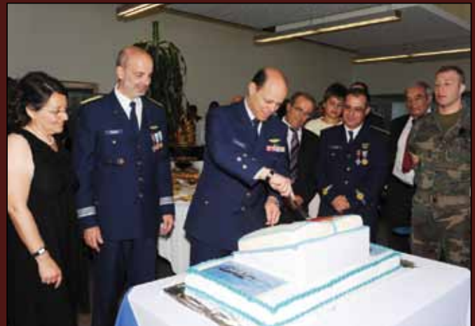
Gen. Jose Pinheiro, Portuguese Air Force Chief of Staff, cuts the cake during the 70th anniversary celebration of Air Base 4, June 22, 2011.