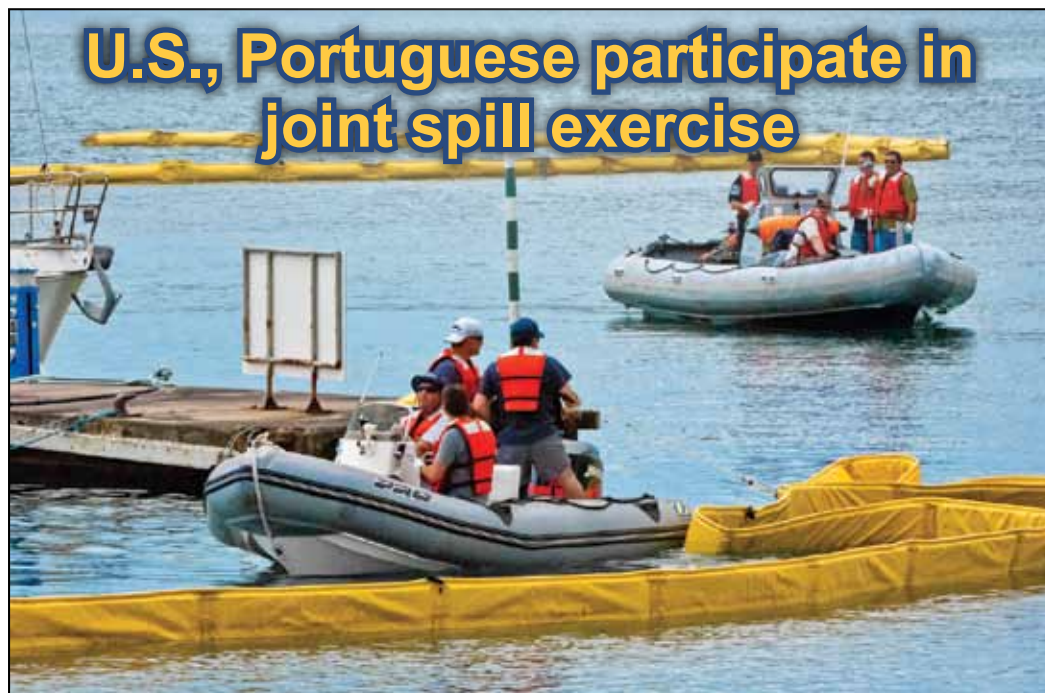
Members of Lajes Field's 65th Civil Engineer Squadron put booms in place to control a simulated fuel spill during a spill-response exercise in Praia da Vitoria Bay, June 15, 2011.

By Staff Sgt. Olufemi Owolabi 65th Air Base Wing Public Affairs