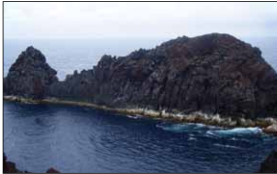
One of the sites visited on the Graciosa tour, The Baleia (Whale) Islet, named because of its likeness to a giant whale.