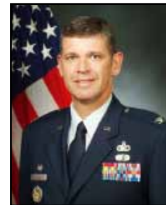
Col. Jose Rivera

The Commander's Action Line is your link to the commander for suggestions, kudos and as a way to work problems or issues within the 65th Air Base Wing for which you can't find another solution. Your chain of command should always be your first option — but when that's not the answer, call or e-mail the Commander's Action Line at 535-4240 or 65abw.actionline@lajes.af.mil.