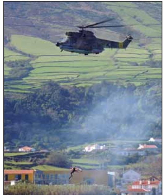
The Puma helicopters, which were recently replaced by two EH-101 Merlin helicopters, first arrived to the Azores in 1977, and have since provided invaluable service, not only to the Azorean people, but also to distressed sailors, saving numerous lives.

During the mission in the Azores, the Puma helicopters logged an impressive record of accomplishments. They were used to evacuate 2,602 patients from other Azorean