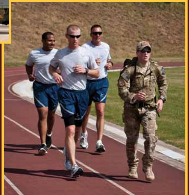
More than 50 Team Lajes members participated in the Air Force Sergeants Association Chapter 1653 half marathon relay at Lajes Field, Azores, May 31, 2011. The money raised went to the Children of Fallen Patriots and the Wounded Warrior Project.