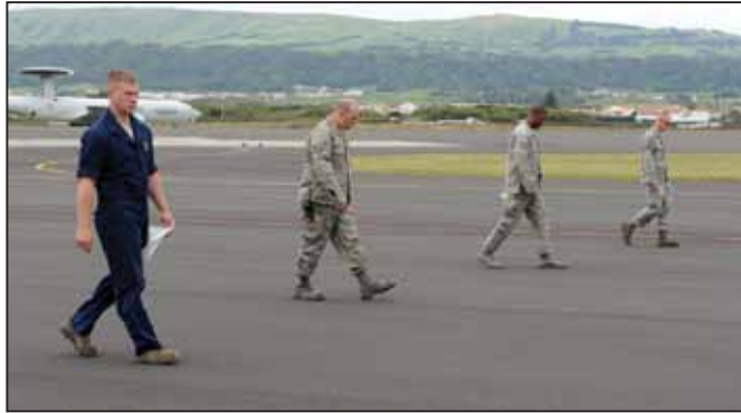
More than 30 Team Lajes members participated in the foreign object elimination walk at the Lajes Field flightline May 19, 2011. The FOE process, although a seemingly simple procedure, could save the Department of Defense millions of dollars in terms of damage it could cause to an aircraft if not removed.

Volunteers aren't authorized to wear metal insignia or badges while on the flightline, hats, wigs, hairpieces, metal hair fasteners, earrings or any other jewelry that may fall off.