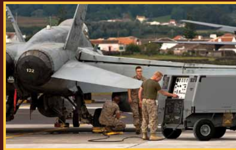
Members from Marine Fighter Attack Squadron 122 check the tire pressure of the F-18 Hornet on the flightline, Lajes Field, Azores, May 31, 2011. Ten F-18 Hornets arrived at Lajes Field on their way back to their home station after their deployment to the area of responsibility.