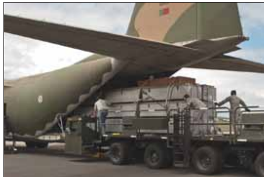
The 65th Air Base Wing and 729th Air Mobility Squadron supported the Portuguese air force mission by helping load Puma helicopter components on a Portuguese C-130. The Puma was retired recently after several decades of distinguished service.

islands to the archipelago's main hospitals, extract 401 injured or sick crewmembers from ships in a total of 348 medivac missions, and also carry out 351 search and rescue missions. Over the course of these missions, an interesting accomplishment was also logged: 17 babies were born aboard Puma helicopters while en route to a nearby hospital. These helicopters also played a major role supporting relief efforts during natural catastrophes, particularly in the aftermath of the Jan. 1, 1980, earthquake that rocked the islands of Terceira, Graciosa and São Jorge, as well as the mudslides in Ribeira Quente on the Island of São Miguel, Oct. 31, 1997.