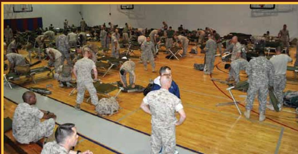
More than 190 of 467 Soldiers and Marines onboard a 767 returning from downrange spent the night at the Lajes Field gym, after their planes were delayed for mechanical issues. The remaining servicemembers were transported by the 65th Logistics Readiness Squadron to off-base lodging until they departed on May 29, 2011.