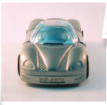
An array of novelty lighters that could be attractive to children.