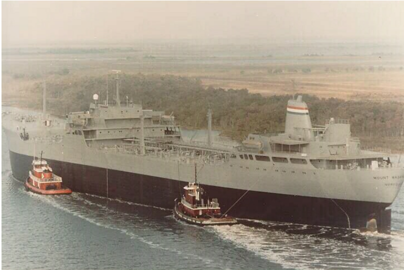
Mount Vernon's sistership, Mount Washington , circa 1980s. Note the divided superstructure, which was typical for tankers when Mount Washington and Mount Vernon Victory were constructed in the early 1960s.