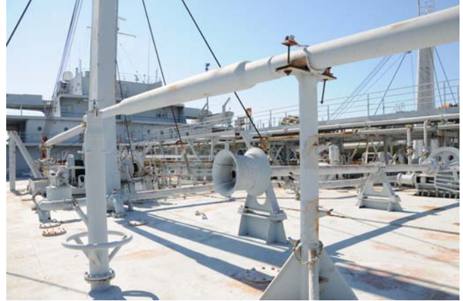
Topside of the Mount Vernon looking forward. Beaumont Reserve Fleet, Beaumont, Texas, January, 2009.