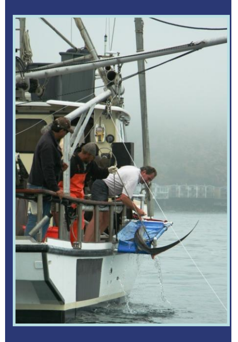
Figure 4. Juvenile common thresher shark on the cradle of the F.V. Outer Banks during the juvenile thresher shark survey. All sharks are tagged and measured prior to being released.