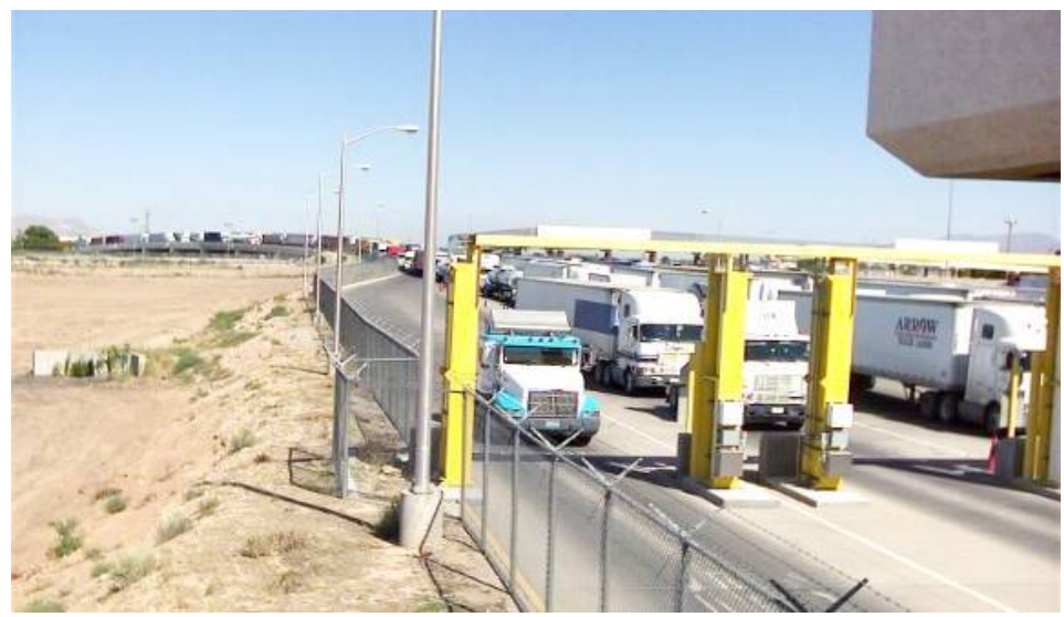
Figure 1. Long Lines of Trucks Waiting To Enter the United States From Mexico

Trucks at the El Paso/Ysleta, Texas border crossing (June 2007)