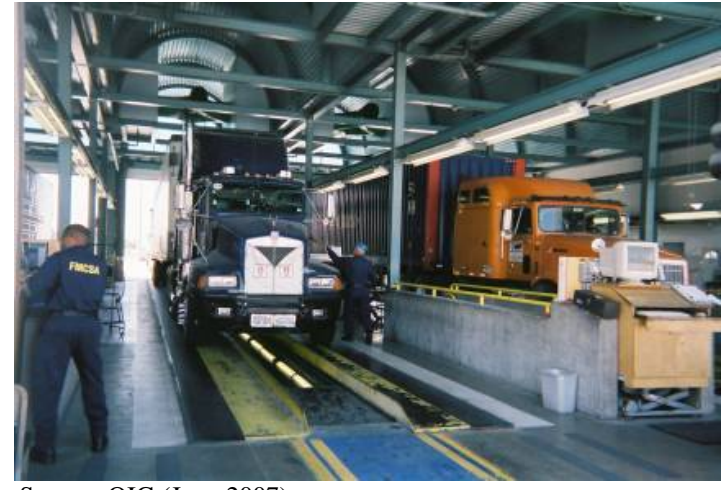
Figure 3. Inspection Facility in Otay Mesa, California

Given our prior audit work regarding the monitoring and enforcement mechanisms FMCSA already had in place before the announcement of the demonstration project, we focused our current work on determining whether FMCSA had implemented the specific provisions of the demonstration project. As discussed in the "Issues" section of this report (see page 1), we found that FMCSA has not developed sufficient plans for checking every demonstration project truck every time and has not done enough to ensure that state enforcement officials understand demonstration project guidance.