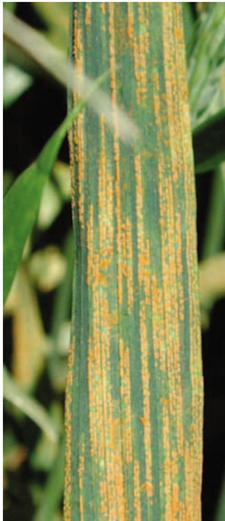
YUE JIN (D517-1)

In Washington, Cara was planted on 17,900 acres in 2011, primarily in the