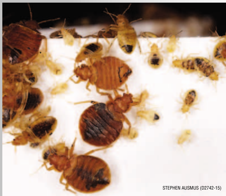
STEPHEN AUSMUS (D2742-15)

Above: Immature bed bugs molt and shed their skins only after blood feeding. ARS entomologist Mark Feldlaufer collects blood-fed, immature bed bugs that he will isolate in vials to collect individual shed skins for chemical analysis.