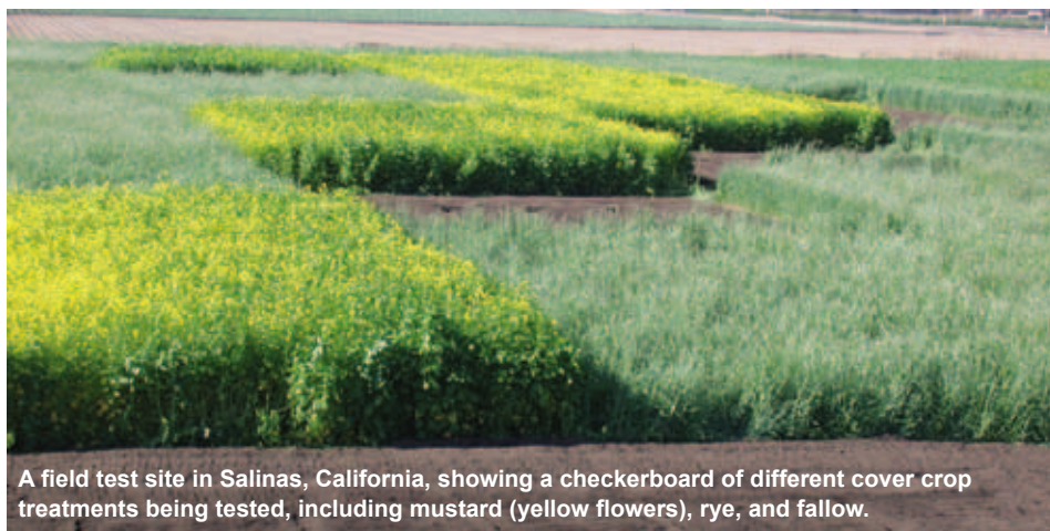
A field test site in Salinas, California, showing a checkerboard of different cover crop treatments being tested, including mustard (yellow flowers), rye, and fallow.

Eric Brennan is in the USDA-ARS Crop Improvement and Protection Research Unit, 1636 E. Alisal St., Salinas, CA 93905; (831) 755-2822, eric.brennan@ars.usda.gov .*