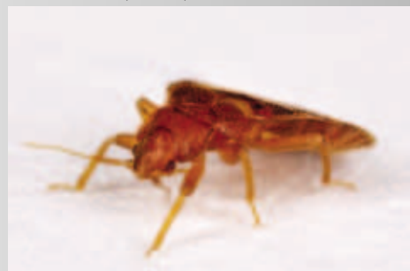
Above: An adult bed bug, Cimex lectularius , is roughly 4 mm in length. Immature and adult bugs are very flat, making it easy for them to hide in cracks and crevices.