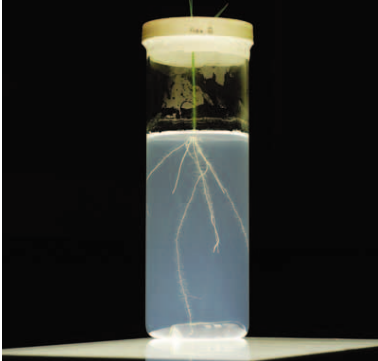
Azucena rice, an upland cultivated variety, growing in a growth cylinder system used to capture the dynamic growth of root systems in three dimensions.

With computers and digital photography, researchers have even developed two- and three-dimensional imaging systems to record roots as they develop in the transparent gels.