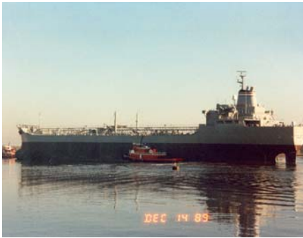
Mission Capistrano circa 1980s.