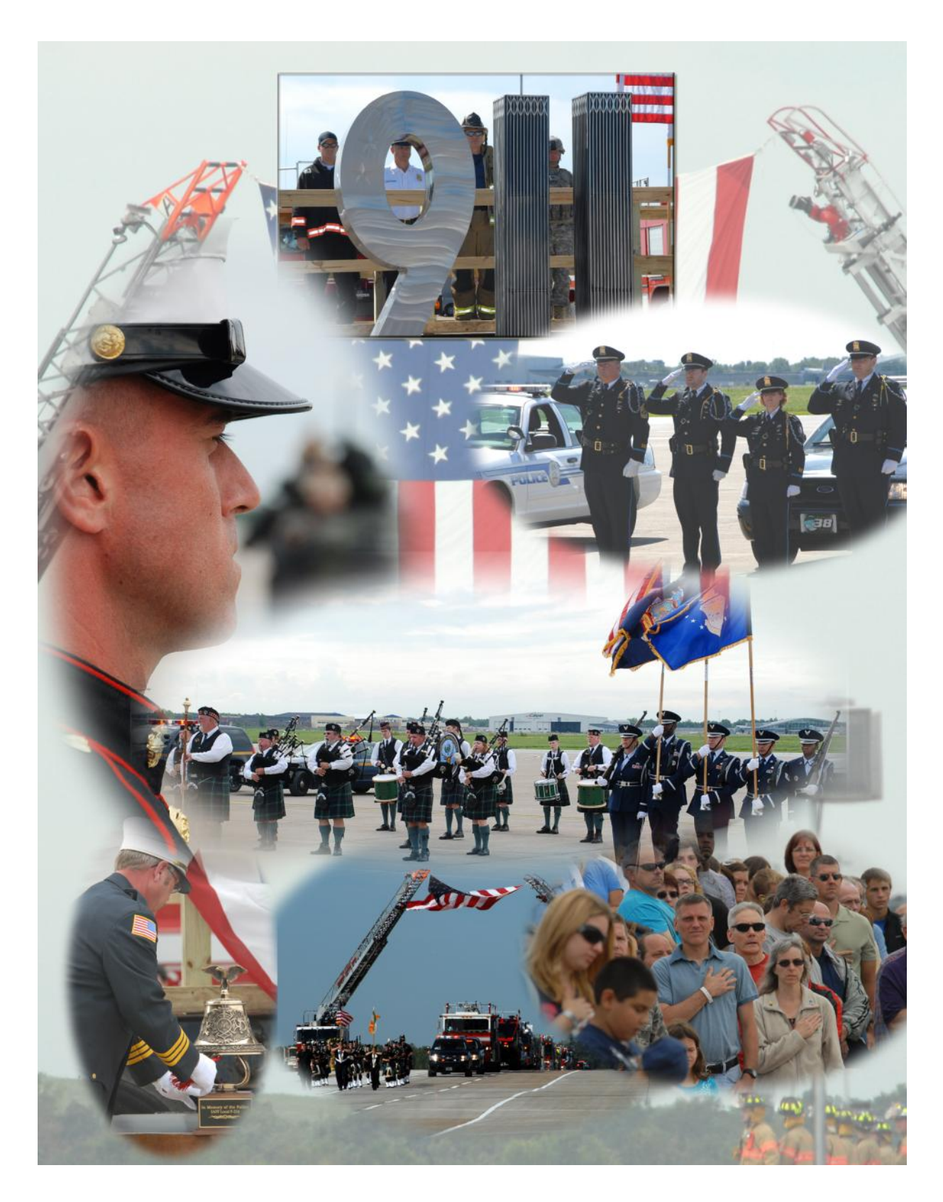
On September 10 & 11 the 107th Airlift Wing and the 914th Airlift Wing held its Thunder of Niagara Air Show 2011. A ceremony was held before the Air Show with first responder's remembering the attacks on 9/11