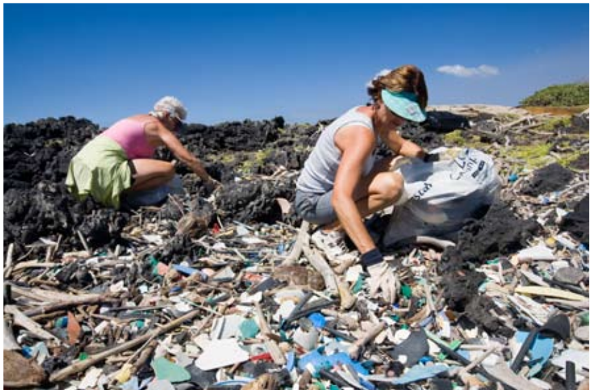
Volunteers cleaning up marine debris from the southeastern shores of the Big Island of Hawaii, one of several debris accumulation areas across the state.

The National Oceanic and Atmospheric Administration (NOAA) Marine Debris Program (MDP) has been a partner in efforts to combat marine debris in Hawaii since 2005. The MDP works in cooperation with partners across the US and internationally to address marine debris. Around the Hawaiian Archipelago, a number of efforts are taking place to address the impacts of marine debris. In order to prioritize Hawaii marine debris issues, the MDP is leading the coordination of the first statewide action plan to address marine debris in Hawaii. With support from NOAA Pacific Services Center, MDP