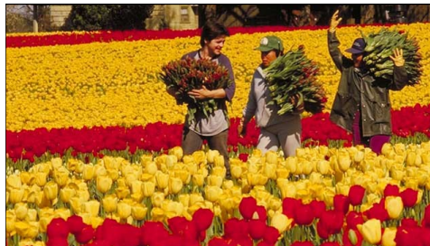
Oregon Dept. of Agriculture

$22,710,000 - Direct Loan Program FSA provides assistance to those unable to obtain guaranteed loans. In FY 2011, FSA funded 28 direct farm ownership loans and 261 direct operating loans, including 188