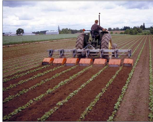
Oregon Dept. of Agriculture

(NAP) provides financial assistance to producers of noninsurable crops when natural disasters cause