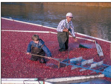
Oregon Dept. of Agriculture

$206,892 - Emergency Conservation Program (ECP) provides emergency funding for farmers and ranchers to rehabilitate farmland damaged by natural disasters and carry out emergency water conservation measures during periods of severe drought.