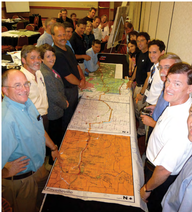
A well-developed plan to increase transportation choices and connect existing communities enabled the Northwest Arkansas Razorback Regional Greenway to win TIGER construction funding.