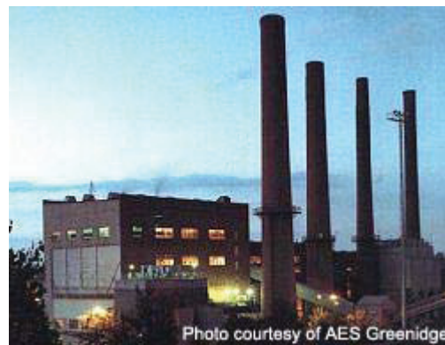
The photo shows a view of the Greenidge power plant facing northeast. Turbine generator Unit 4, a 107-MW output reheat unit, is at left.