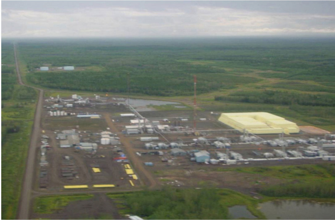
Apache Canada Zama gas plant and oil production facility.