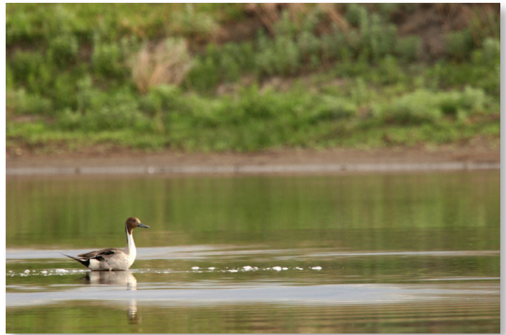
A drake pintail rests in a prairie pothole.

The PCOR Partnership Validation Phase projects demonstrated that geologic storage is not just an option for the distant future, but is now being implemented on a large scale for both environmental and commercial reasons. The PCOR Partnership estimates additional oil recovery through regional EOR applications of over 1.4 billion barrels, with a value of approximately $100 billion at U.S. $50 per barrel. Overall, based on the current geological formations characterized, the PCOR Partnership region has the potential to geologically store 417 billion metric tons of CO 2 in saline formations, 2.9 billion metric tons in depleted oil and natural gas fields, and 7.3 billion metric tons in unmineable coal seams.