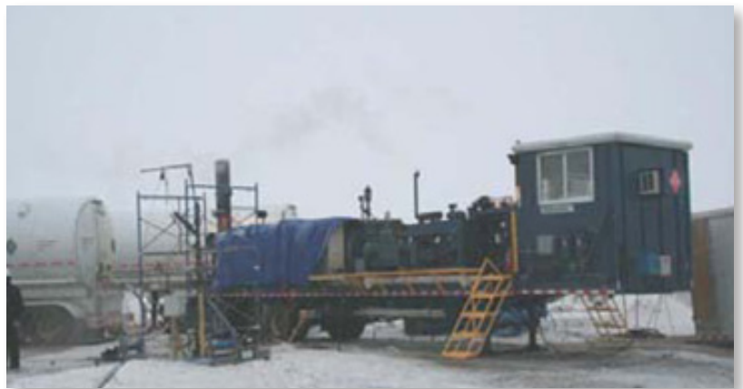
CO 2 Injection Rig for Lignite Injection Test