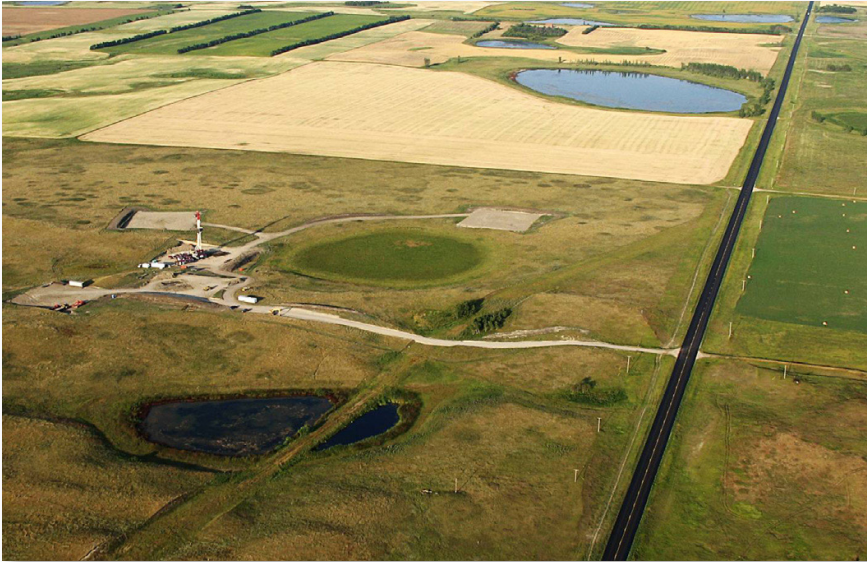
Lignite test site with rig set up at injection well, showing five-spot configuration