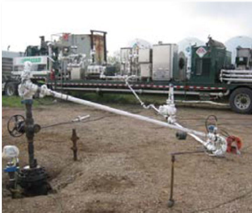
CO 2 Injection Rig for Williston Basin EOR Field Test