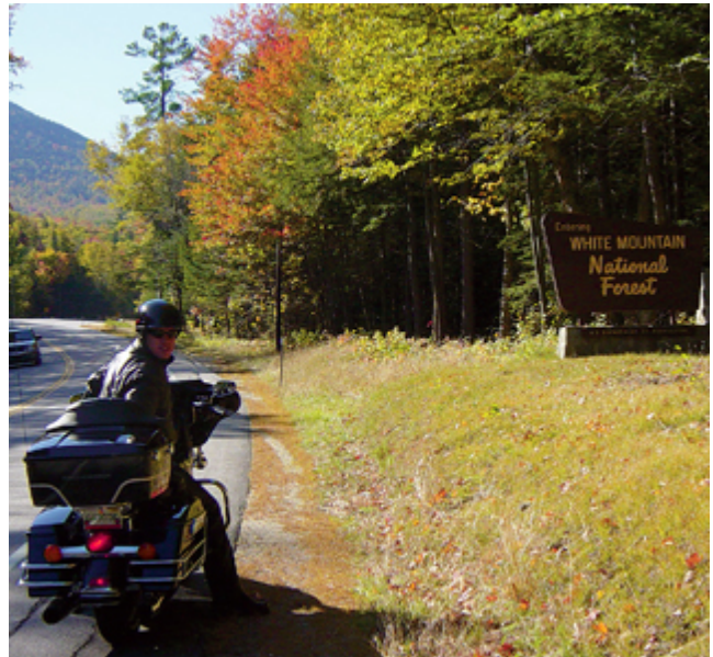
Ah! Nothing like the crisp Autumn air!