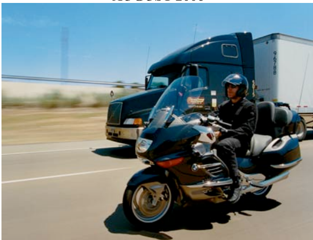
This guy is sloppy! Riding techniques discussed.