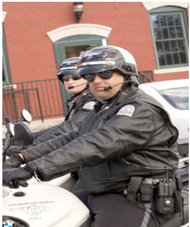
A sight we hope we never encounter - especially if we forgot our insurance card! We discussed the various types of insurance coverage, and why liability-only coverage may be cheap in the short run, but could cost you more in the long run.