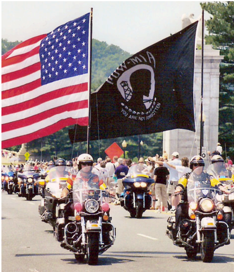
What makes our country great: Our flag and our vets. Rolling Thunder 2007

MAY MMP WORKING LUNCH: The MMP met on Wednesday, 30 May 2007, from 12:00 to 12:30, in the Command conference room at Swartworth Hall. In attendance were: