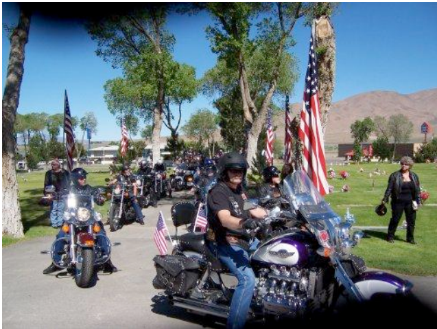
Our June issue recalls Memorial Day.