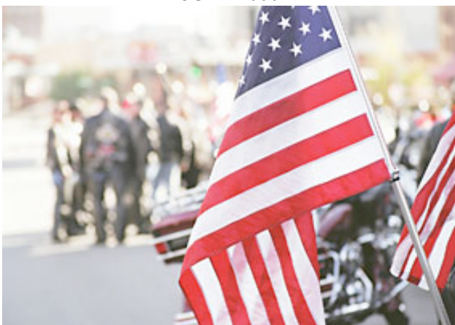
Independence Day: Flags, vets, and Harleys.