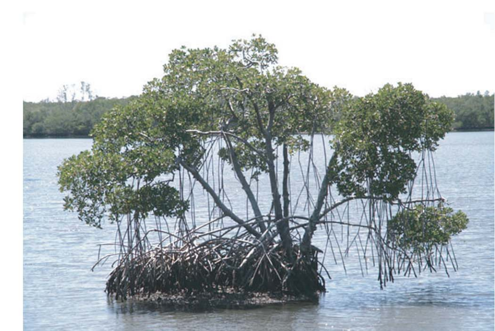
Red mangrove in West Lake Park.