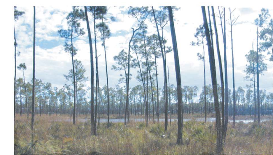
Pinelands in Everglades National Park grow on porous limestone or limestone with a thin soil cover.

Pinelands, or pine flatwoods, are the most common plant communities in Florida. Pinelands occur on nearly level land composed of coarse, poorly drained soil, or on porous limestone. Longleaf pine and slash pines are the dominant trees in pinelands. Understory plants commonly include saw palmettos, wildflowers, and ferns.