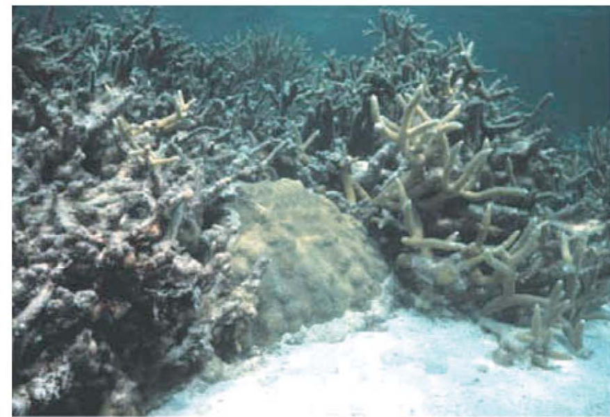
Star and staghorn coral found in the Florida Keys.

Over 30 different kinds of corals are found in Florida waters. Individual corals are interconnected colonies of soft, fleshy polyps that secrete complex shells made of calcium carbonate. These colonies can form branching corals or massive head corals depending on species. As the colonies compete for space, and as dead colonies are replaced, they grow on top of each other and build what we call a coral reef. Coral reefs provide habitat for thousands of species of plants and animals.