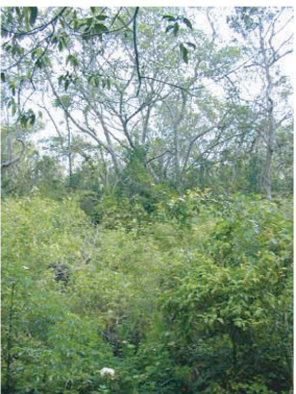
Hardwood hammock in Fern Forest Park.

Hardwood hammocks are localized, thick stands of hardwood trees that can grow on natural rises of only a few inches of land. Hammocks in the Everglades perpetuate themselves by building up thick layers of soil and peat, thus providing high ground for the trees to grow. In south Florida, hammocks occur in marshes, pinelands, and mangrove swamps. Hammocks rarely flood because of their slight elevation. Woodland that is not logged or burned for 20 or more years will develop into a hammock.