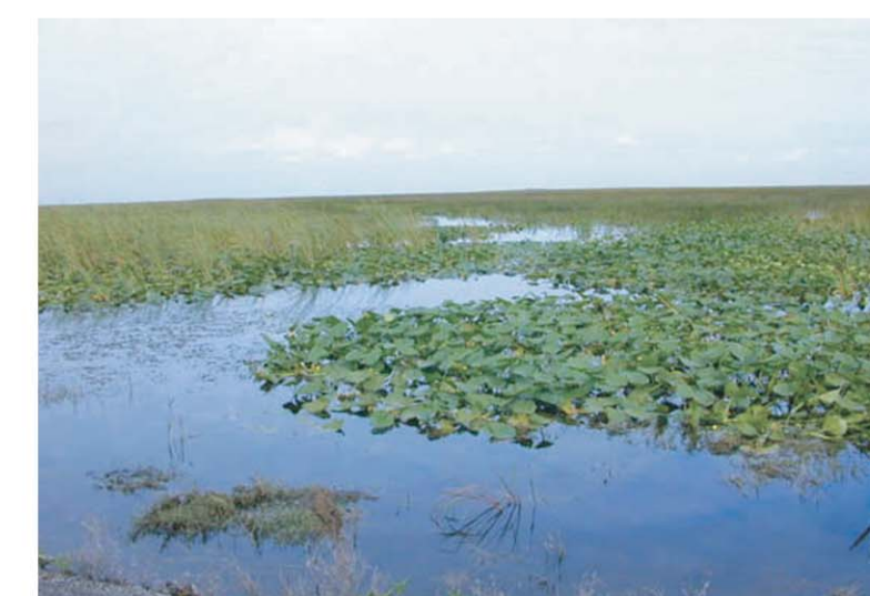
Freshwater marsh in Water Conservation Area 3.