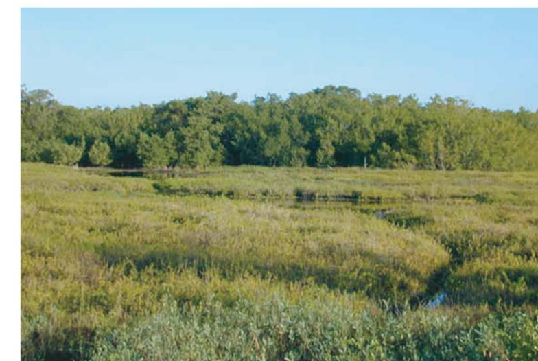
Salt marsh at Everglades National Park.