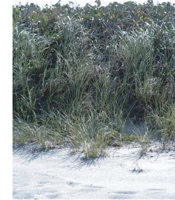
Close-up of dunes at Blowing Rocks beach.

A little over 60% of Florida's coastline is sandy. South Florida's beaches are primarily composed of quartz sand along northern and central coasts, and calcium carbonate sand along southernmost coasts.