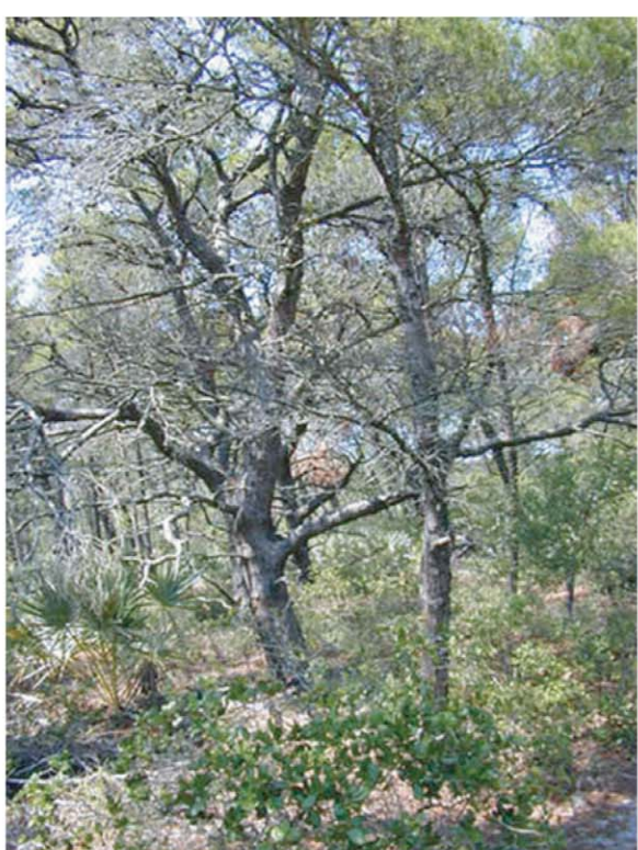
Scrub community at Jonathan Dickinson State Park.

Generally, scrubs are communities dominated by pinewoods with a thick understory of oaks and saw palmetto. Scrubs occupy well-drained, nutrient-poor, sandy soils. Plants that grow here have adapted to dry conditions. Fires play an important role in scrub ecosystems; in the absence of fires, a hardwood forest of oak will develop.