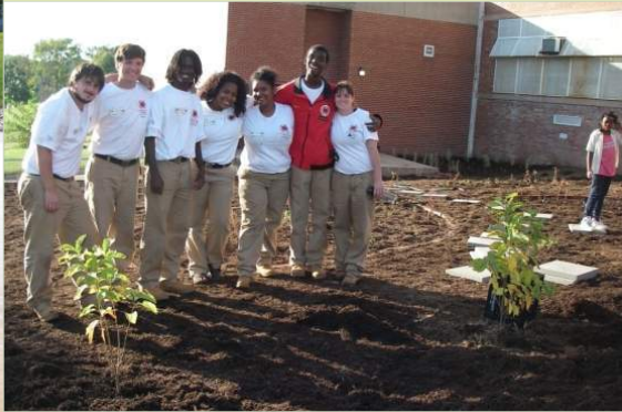
Student Owned – Student Operated