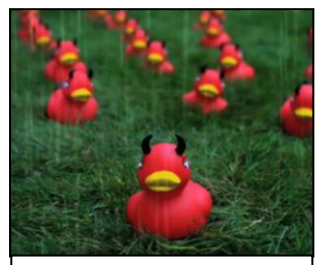
Rubber Ducky Public Service Announcements show what happens when it rains. See this great ad and other ThinkBlueMaine products at: www.thinkbluemaine.org/