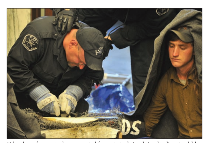
Helena law enforcement take measures to defeat protester devices designed to disrupt and delay daily operations at the state capitol. Law enforcement have said CDP training led to their successful response.

The CDP offers three Field Force Courses. Field Force Operations prepares law enforcement to employ crowd control measures and civil disorders; Field Force Command and Planning is designed for management-