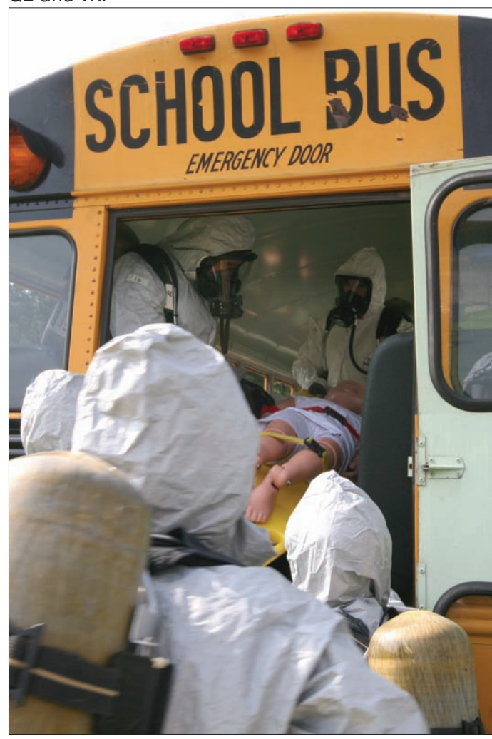
A survivor is extracted from the simulated accident as other first responders receive the patient for decontamination and treatment.

performs hazardous materials technician operations in a CBRNE response environment using nerve agents GB and VX.