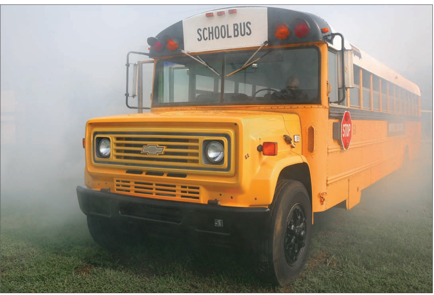
Responders attending the Hands-On Training for CBRNE Incidents (HOT-I) course will now have an added level of realism thanks to a school bus the CDP recently added to the simulated mass casualty exercise for each class.