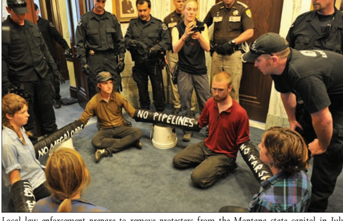
Local law enforcement prepare to remove protesters from the Montana state capitol in July apparent to the protes-2011.

HELENA, Mont.-The city of Helena, Mont. garnered national attention in mid-July when approximately 70 environmental activists from Montana and other states gathered at the state capitol to dispute construction of a planned pipeline from Alberta, Canada through Montana. Thanks to training through the Center for Domestic Preparedness (CDP), the local Civil Disobedience Team (CDT) was prepared to