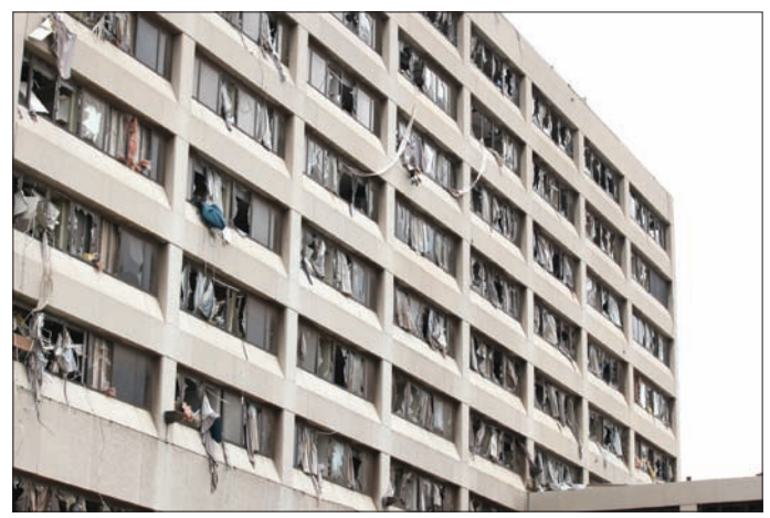
The exterior windows of St. John's Regional Medical Center displays the danger patients and workers experienced.

JOPLIN, Mo.—In May 2011, as tornado sirens sounded, hospital workers at St. John's Regional Medical Center, in Joplin, Mo., rushed to pull 183 patients to safety as one of the largest tornadoes on record bared down on their southwestern Missouri city. Breaking glass and the roar of the powerful storm deafened the dark hospital as power was lost.