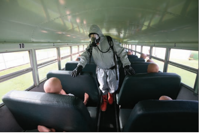
A responder surveys the simulated accident scene to triage potential survivors. Recently the of the course, the respond-CDP incorporated a school bus into training scenarios at the COBRA Training Facility. er enters the CDP's toxic

When the first team entered the bus they noticed child-size mannequins with a variety of symptoms.