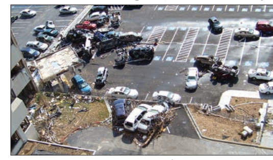
Vehicles tossed by the storm litter St. John's parking lot.

"The CDP training helped me fulfill my role with