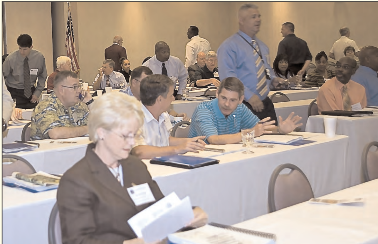
About 70 DLA Land and Maritime forward execution associates from around the United States and the world met in Columbus Aug. 2-6 to network, train and learn how to better support DLA's military customers.

The first half of this year's conference was held at the Concourse Hotel near Port Columbus International Airport and included briefings and training sessions on topics of common interest to everyone. The second half of the conference was held at DLA Land and Maritime and included breakout sessions in training rooms and main sessions in the Building 20 auditorium, along with opportunities for attendees to meet Columbus associates with whom they regularly interact.