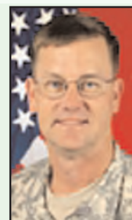
Army Brig. Gen. Lynn A. Collyar

Collyar also was commander of the Defense Distribution Center in New Cumberland, Pa., from August 2006 to August 2008.